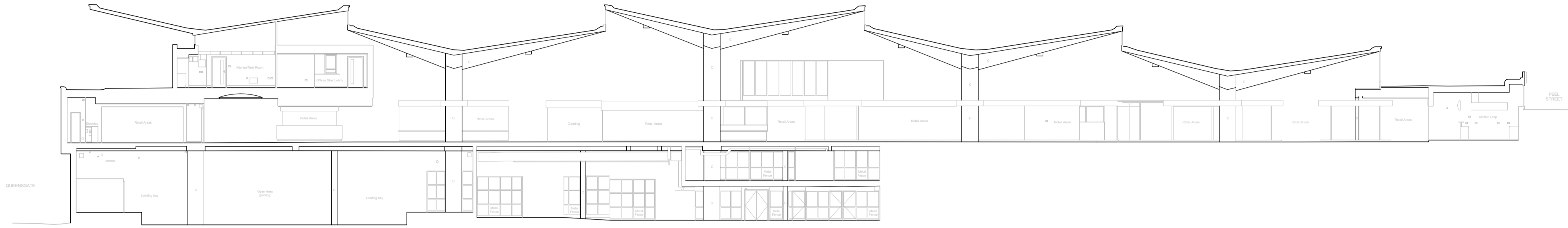
5 Section 05 1 : 200