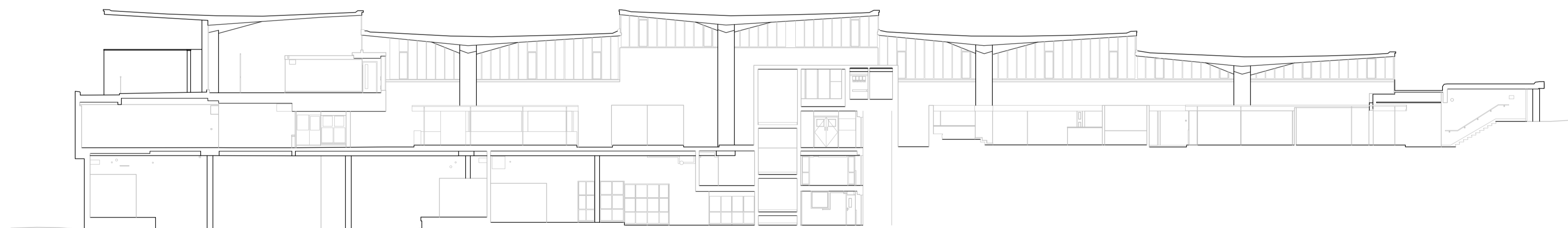
6 Section 06 1 : 200