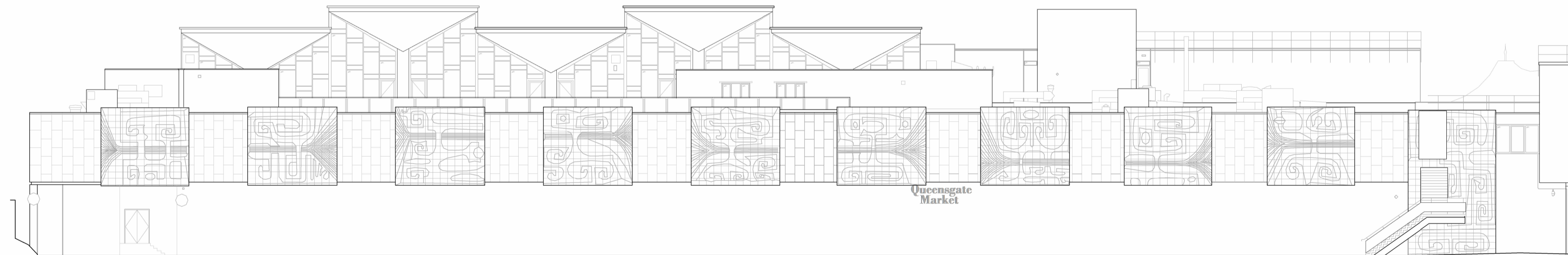
2 East Elevation Existing 1 : 200