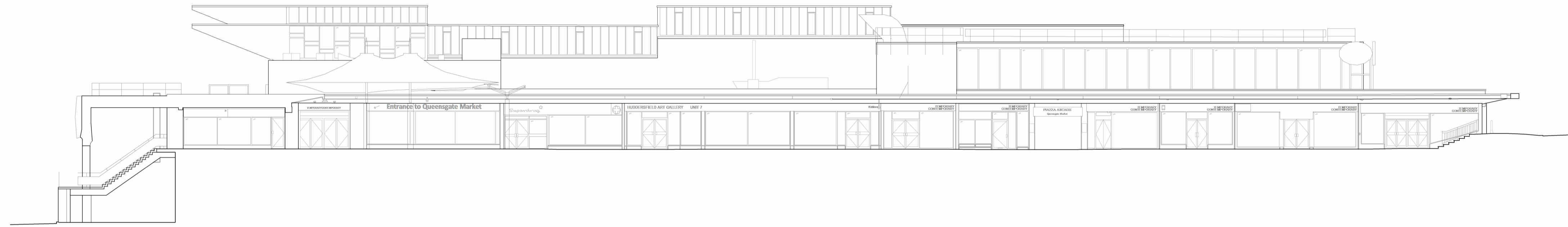
1 North Elevation Existing 1 : 200