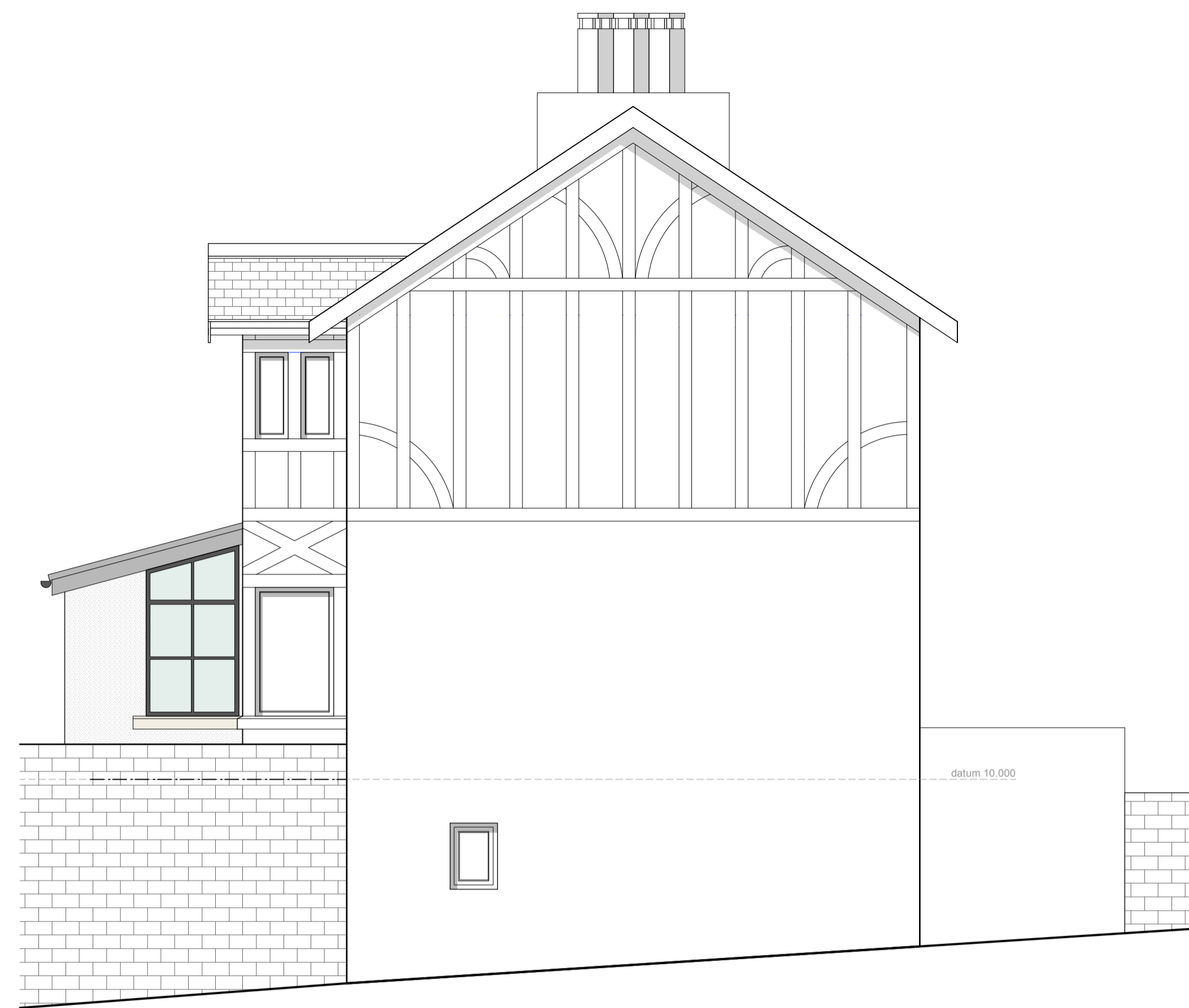
south west elevation