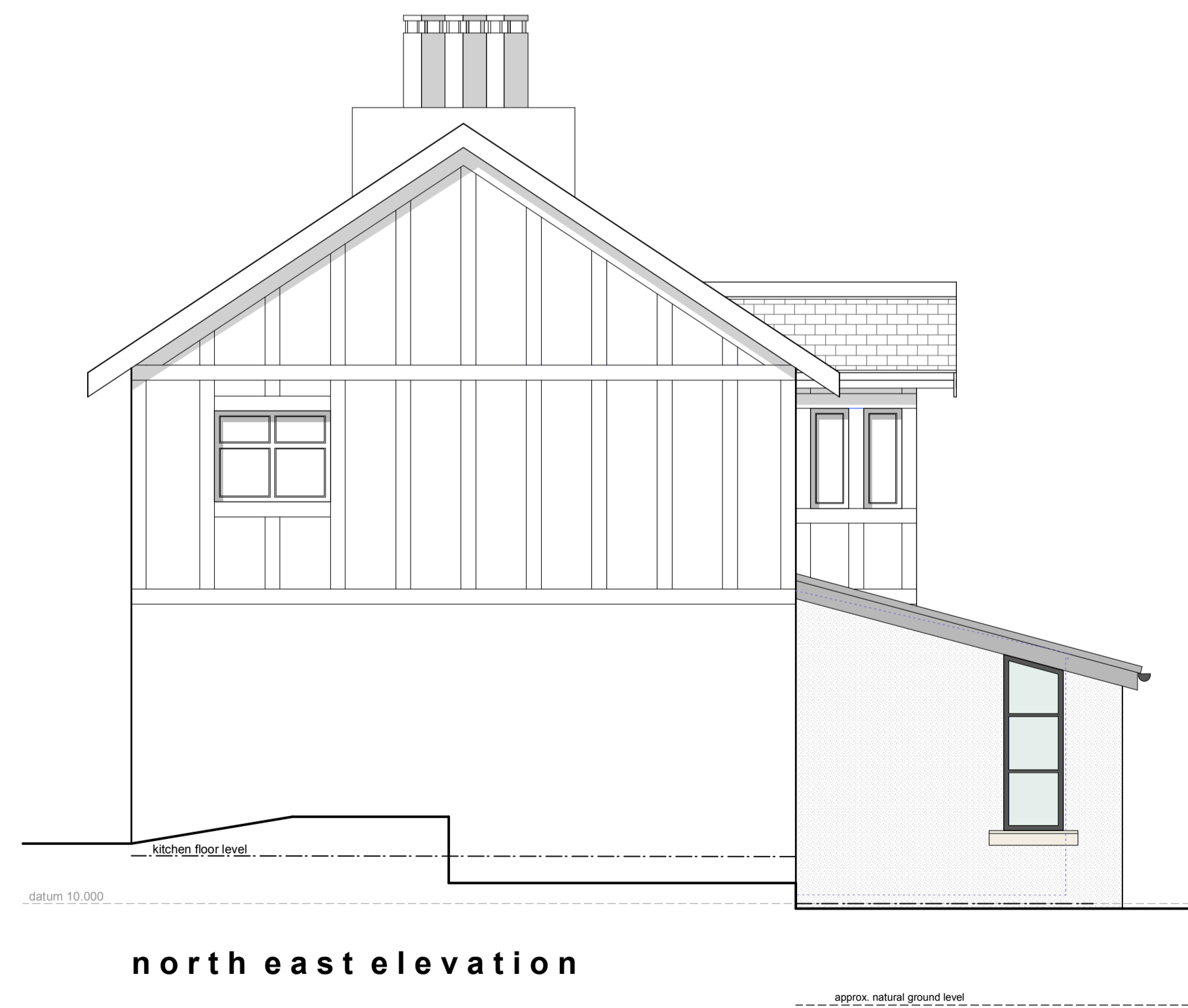
north east elevation