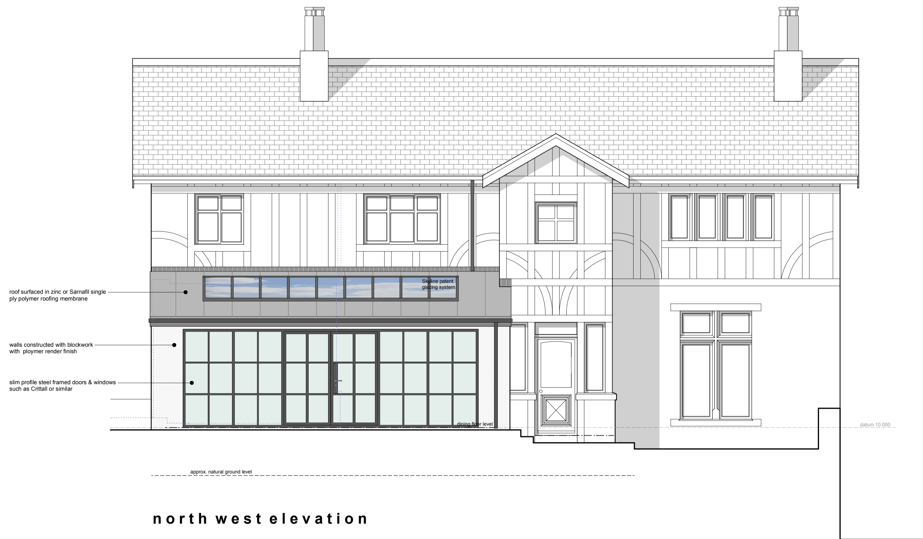
north west elevation