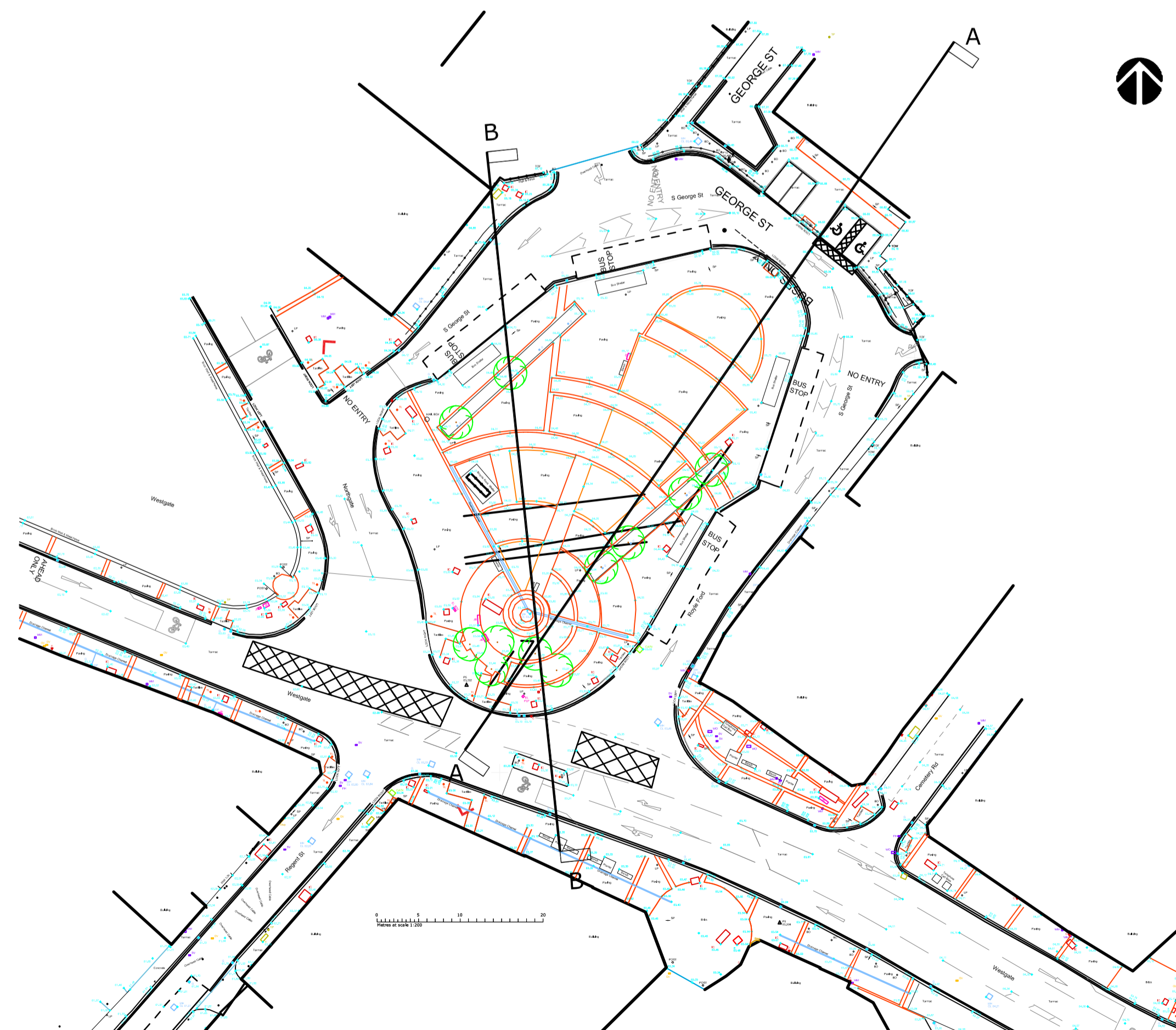
Existing Site Plan Scale: 1:500