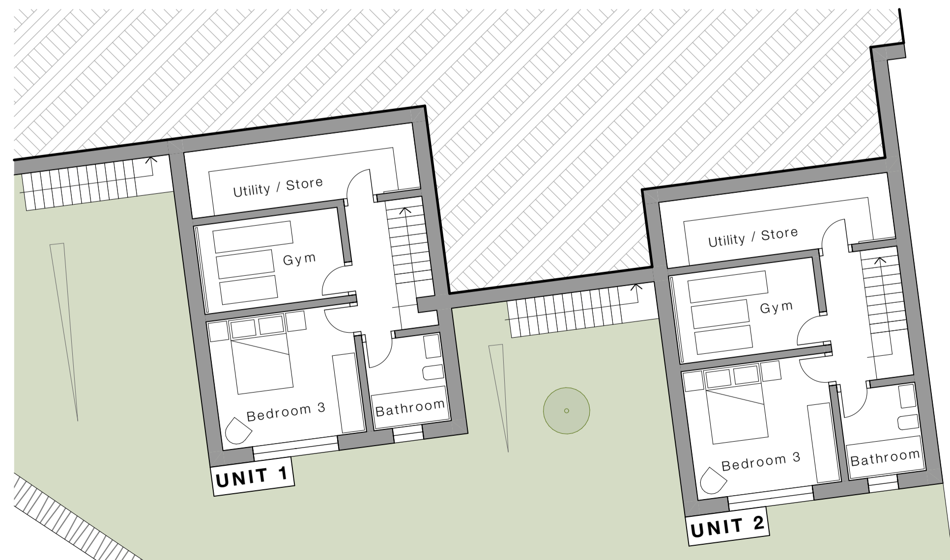
Proposed Lower Ground Floor Plan - 1:100