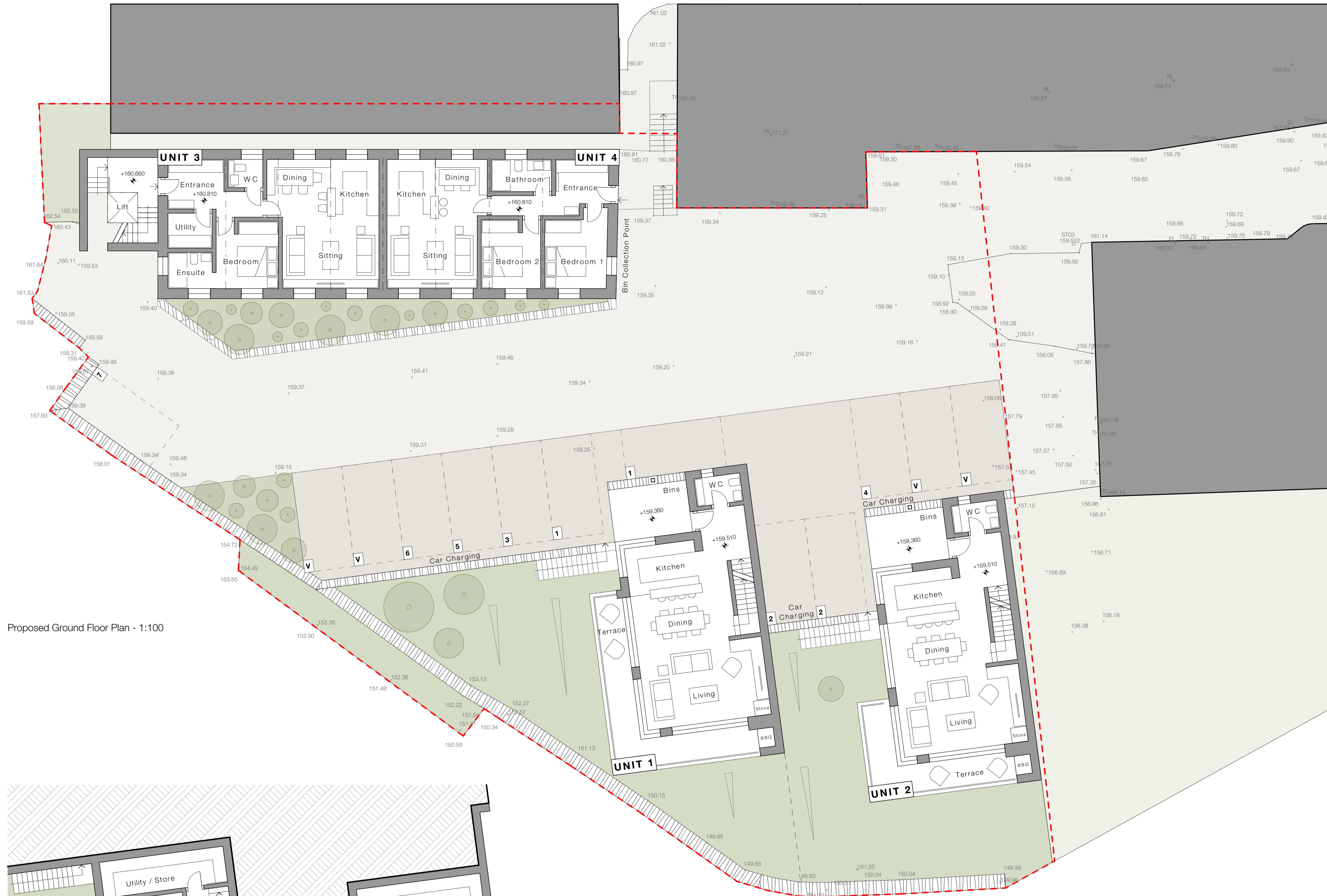
Proposed Ground Floor Plan - 1:100