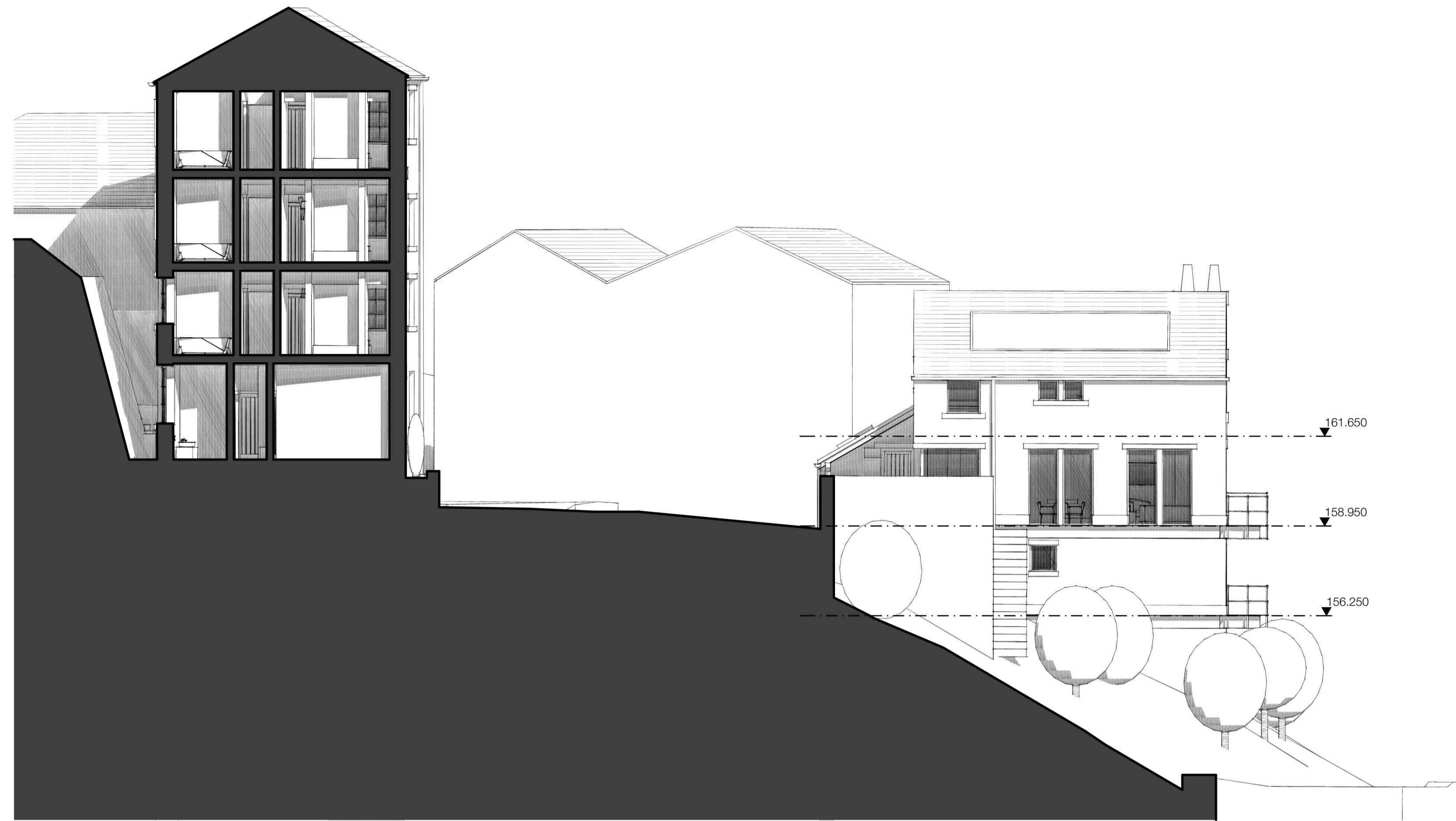
Proposed West Elevation - 1:100