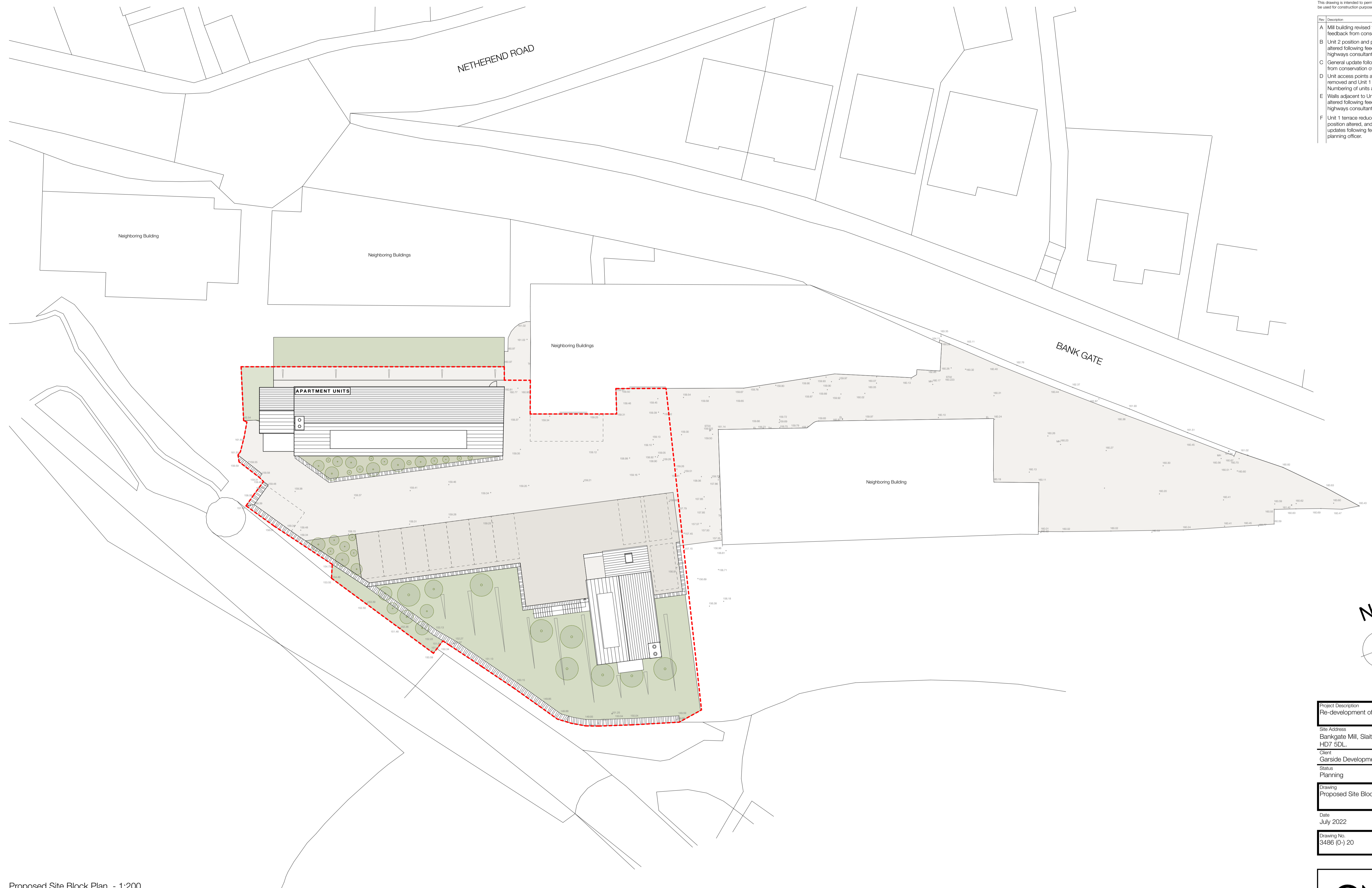
Proposed Site Block Plan - 1:200