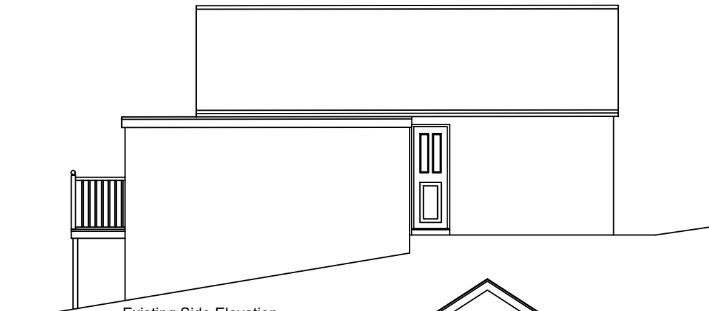
Existing Side Elevation.