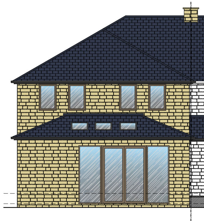
3. Proposed North Elevation Scale 1:100