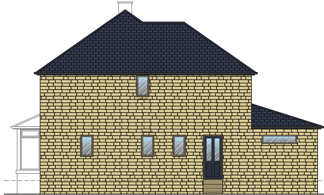
2. Proposed East Elevation Scale 1:100