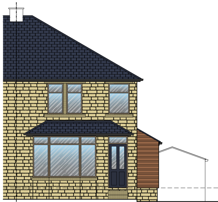
1. Existing South Elevation Scale 1:100