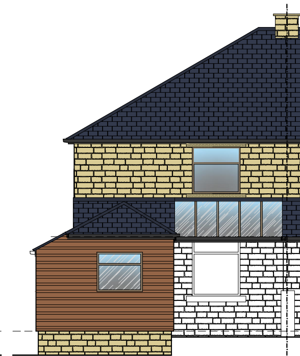
3. Existing North Elevation Scale 1:100