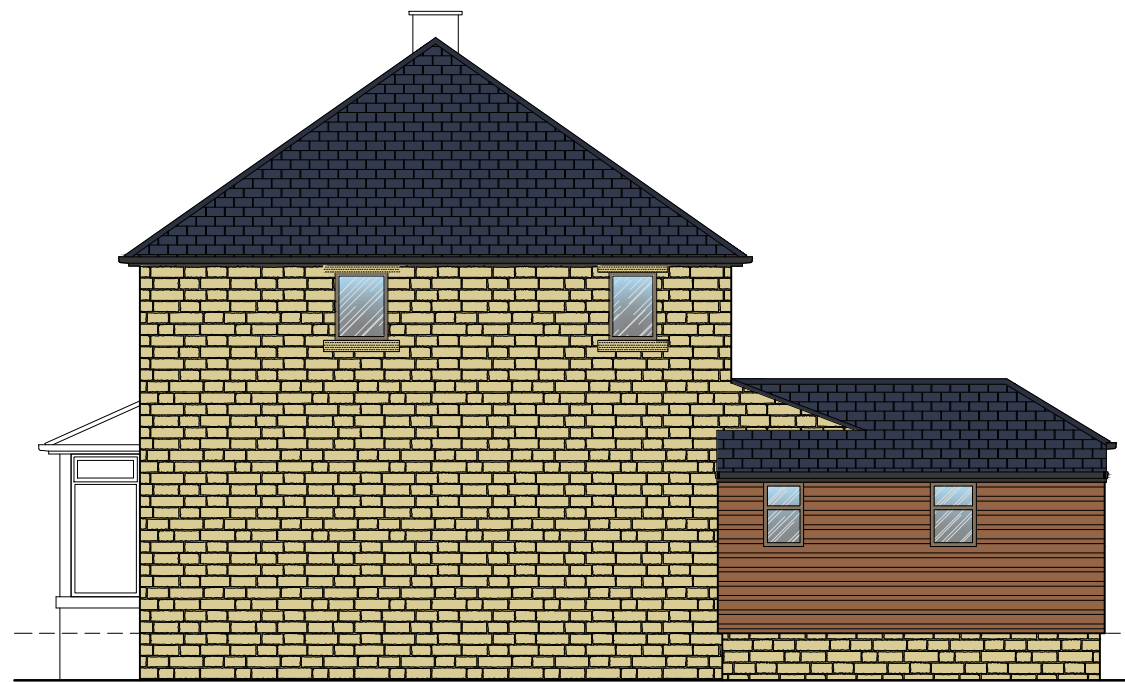
2. Existing East Elevation Scale 1:100