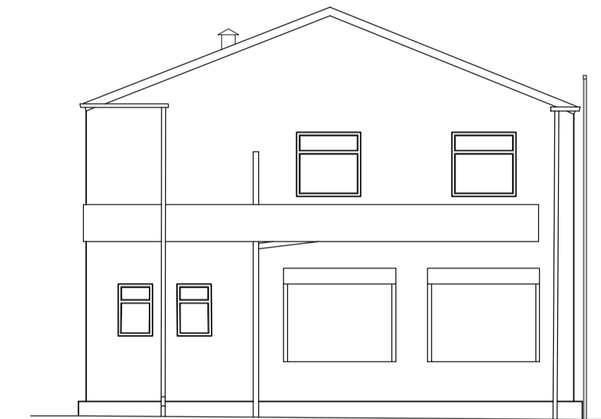
West Elevation (Side)