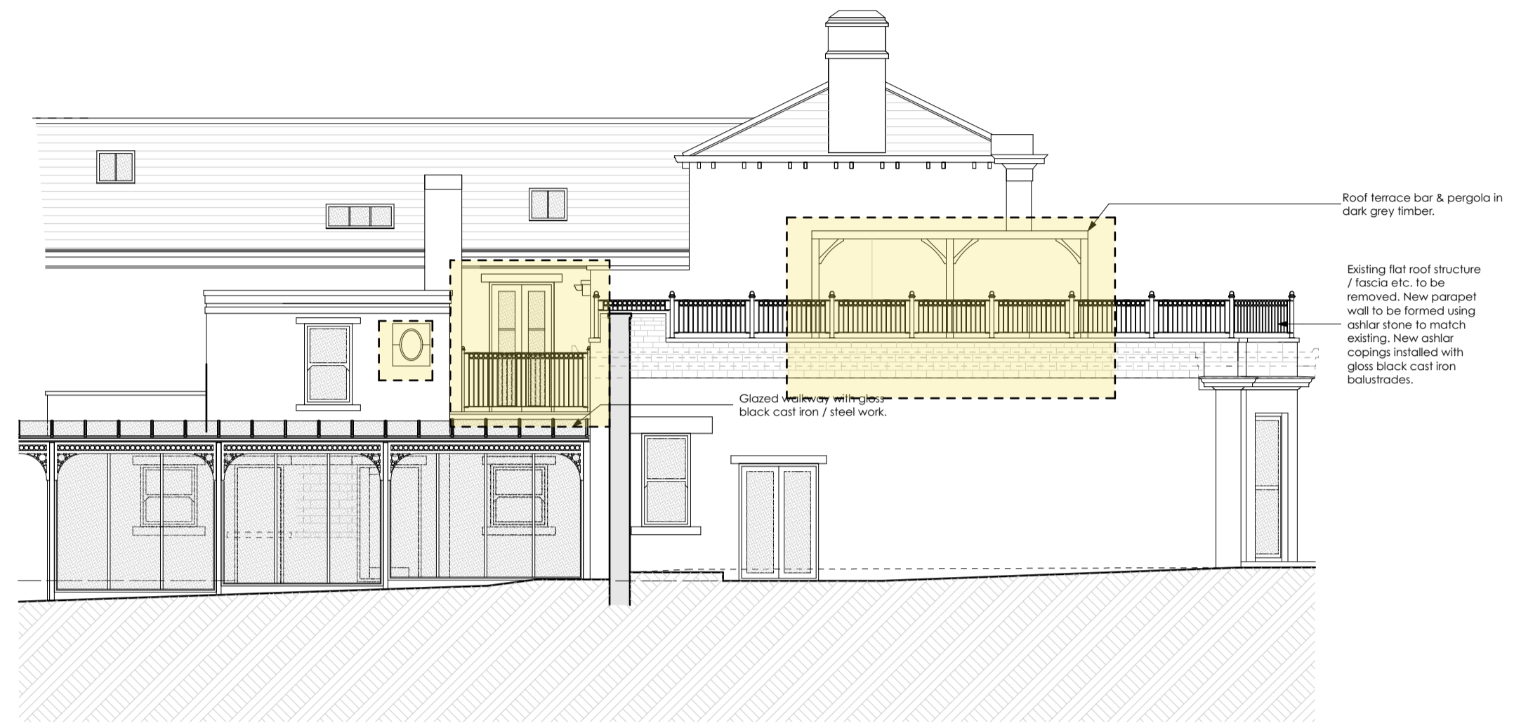
Sectional Elevation K