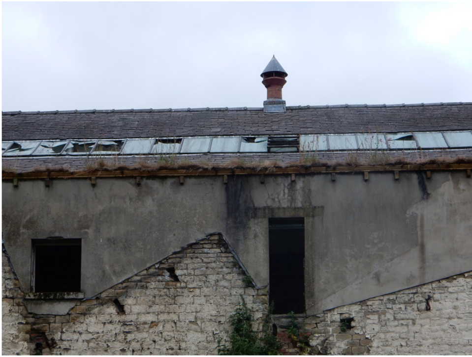
Photograph 9 -North elevation, roof