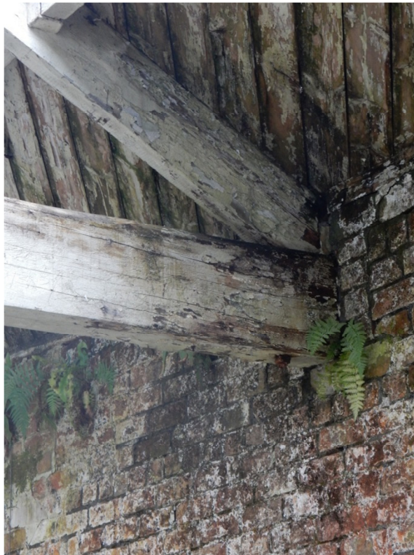
Photograph 14 – Roof truss bearing