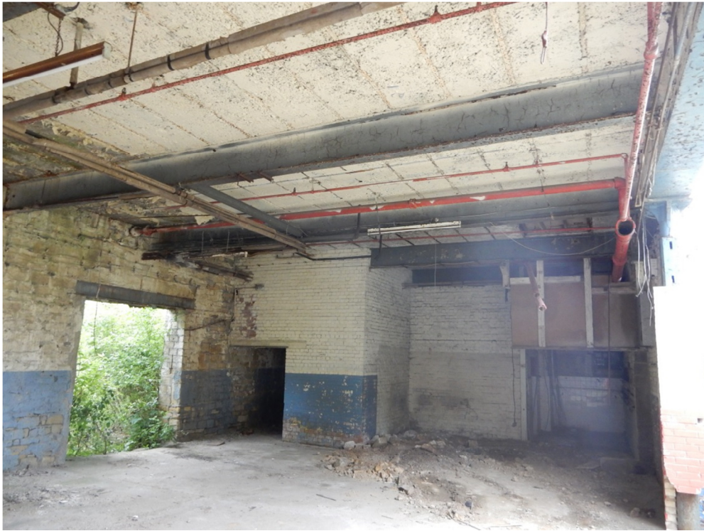
Photograph 11 -Ground floor