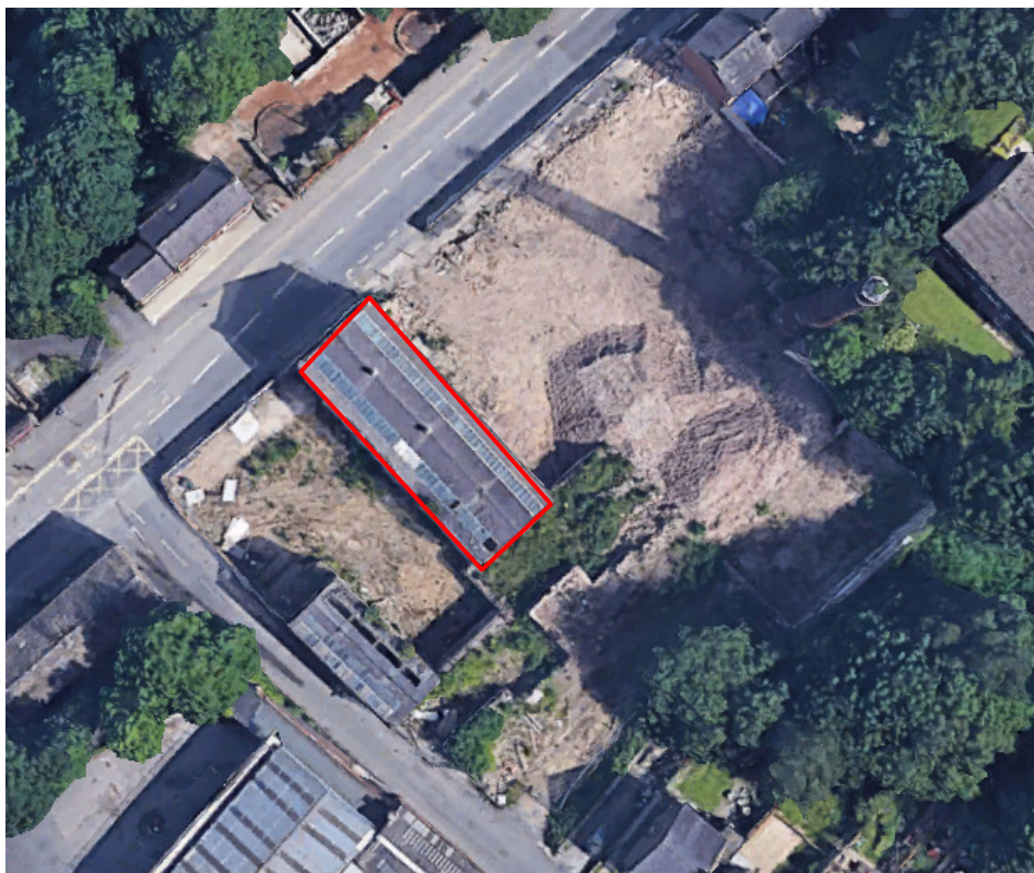
Figure 1 – Mill Building 1 location, plan view

2.1 The mill location is shown in the aerial image of the site below;