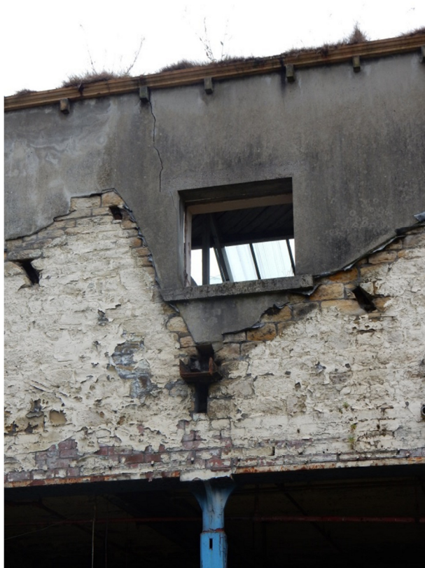
Photograph 7 -North elevation, render cracks