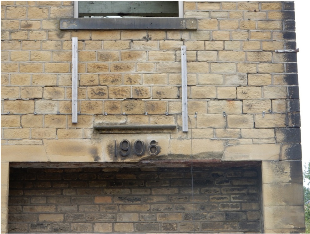
Photograph 1 – West elevation, masonry cracks