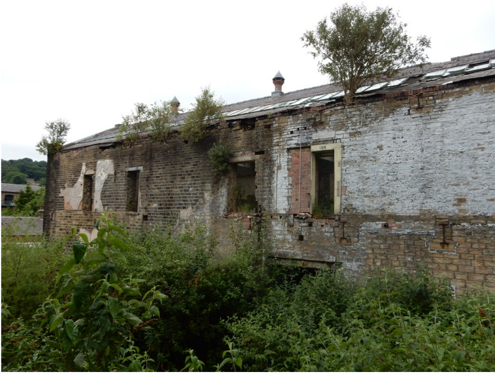
Photograph 3 – South elevation