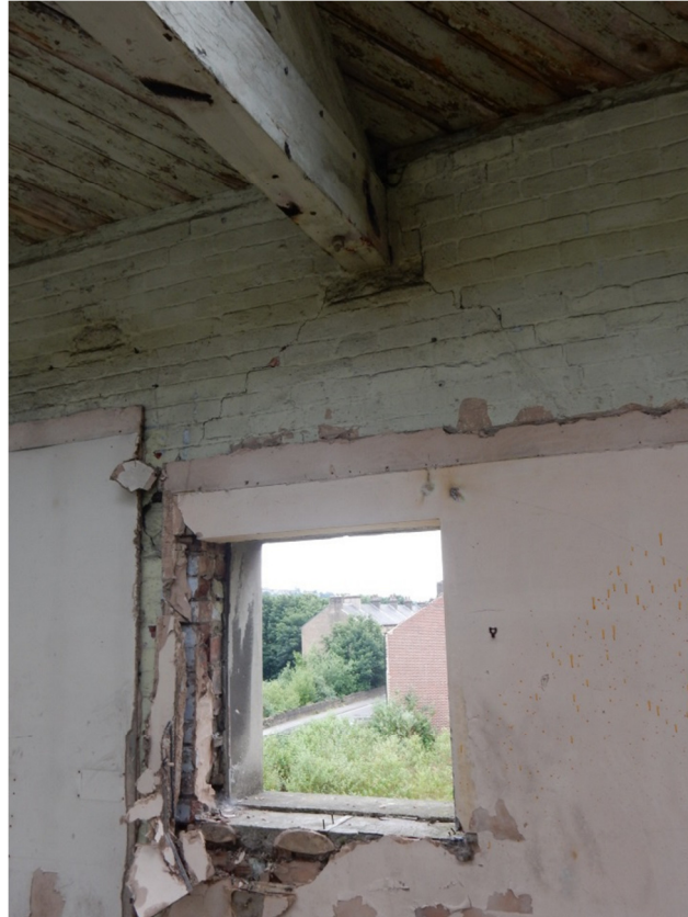
Photograph 16 – First floor masonry cracks