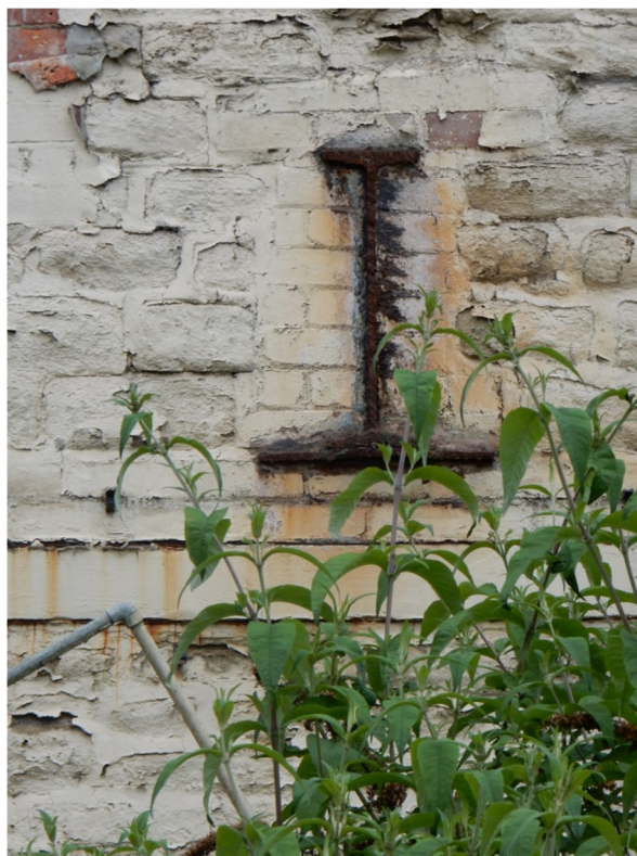
Photograph 8 -North elevation, built in steel beam