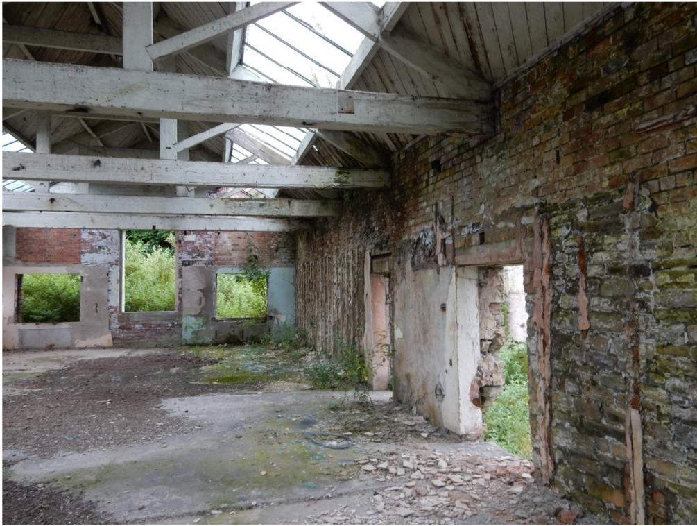
Photograph 13 –First floor