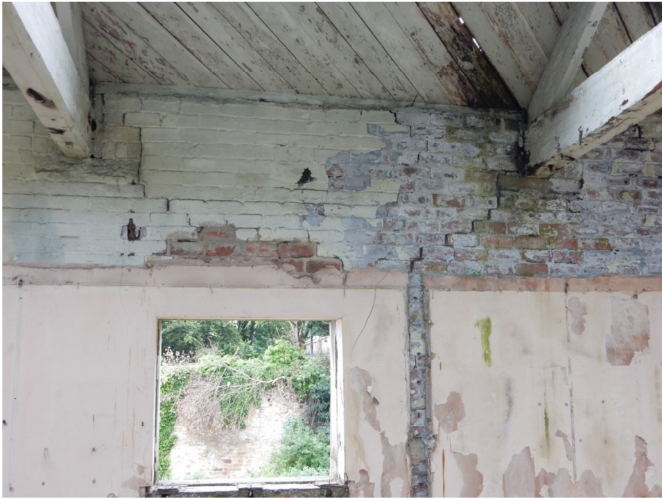
Photograph 15 – First floor masonry cracks