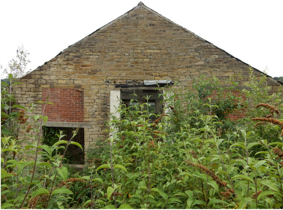
Photograph 5 – East elevation