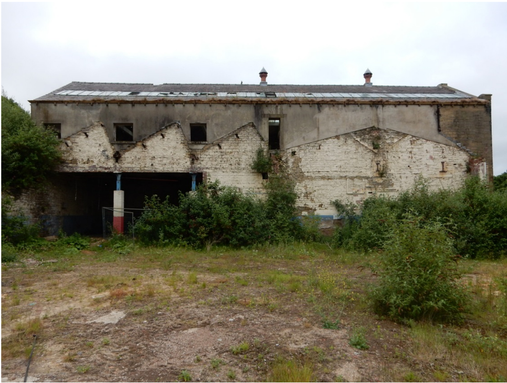
Photograph 6 – North elevation