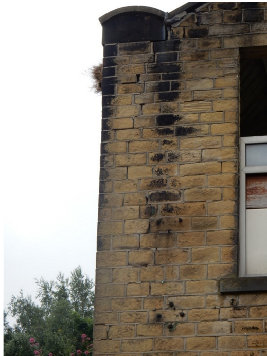
Photograph 2 – West elevation, masonry cracks