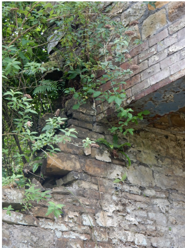
Photograph 10 -North elevation, beam bearing