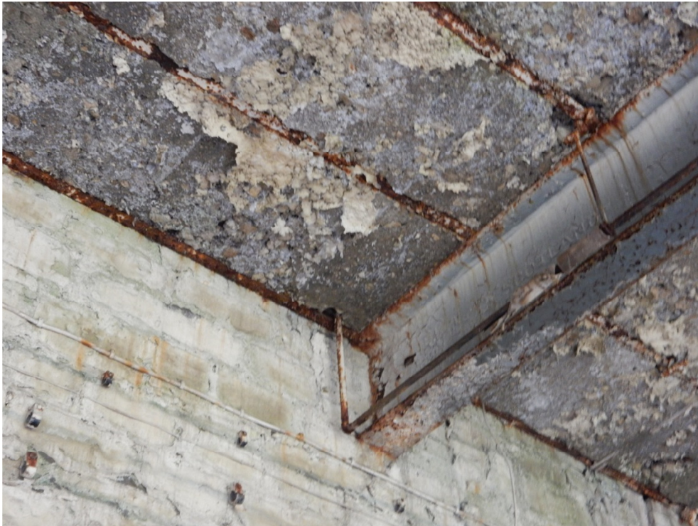
Photograph 12 -Underside of first floor