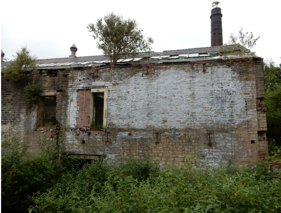
Photograph 4 – South elevation