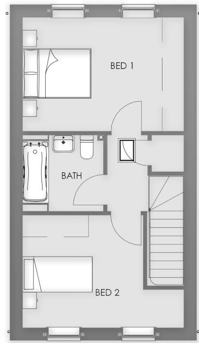
FIRST FLOOR LAYOUT 1 : 100