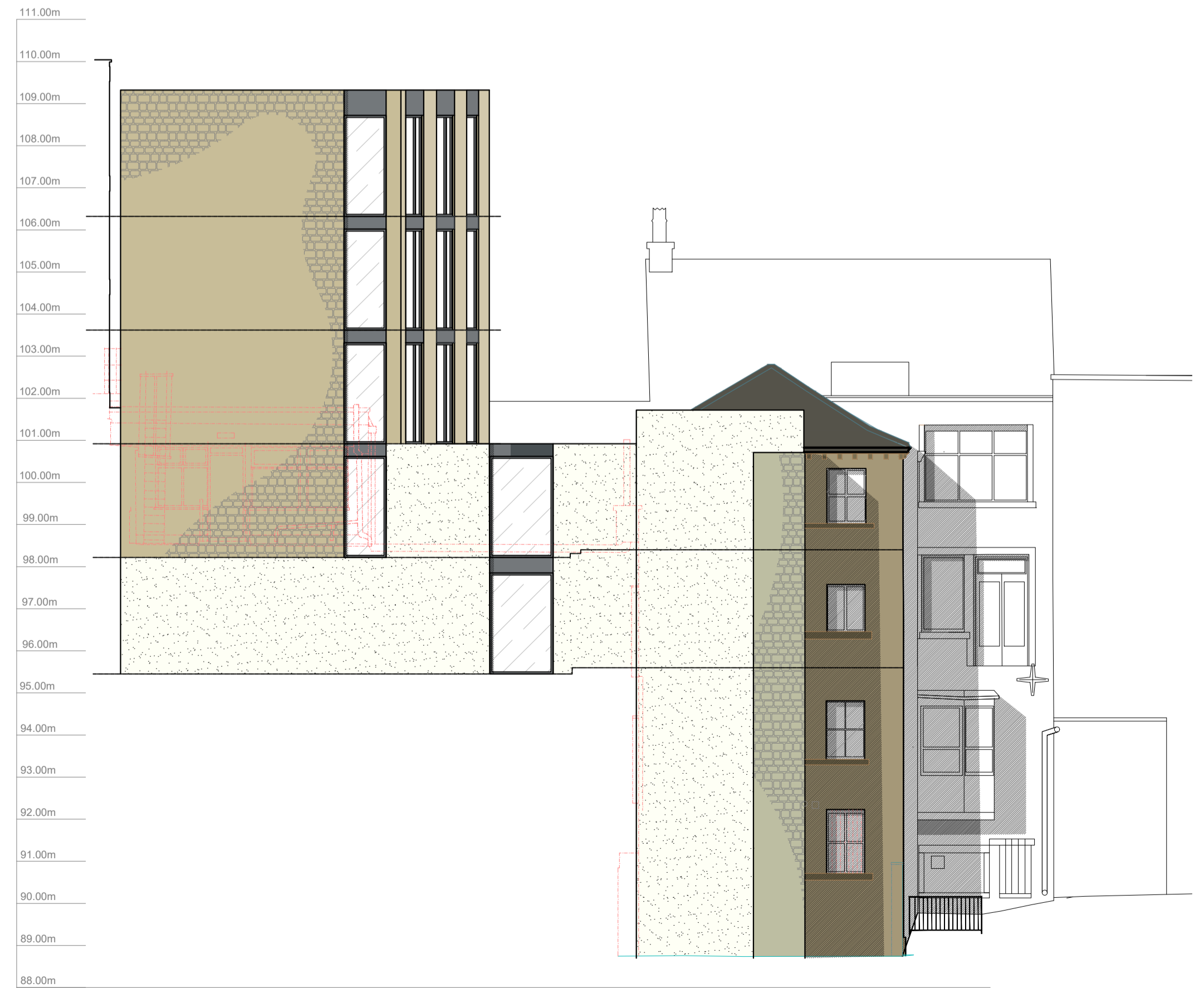
ELEVATION 4 - ALBERT YARD