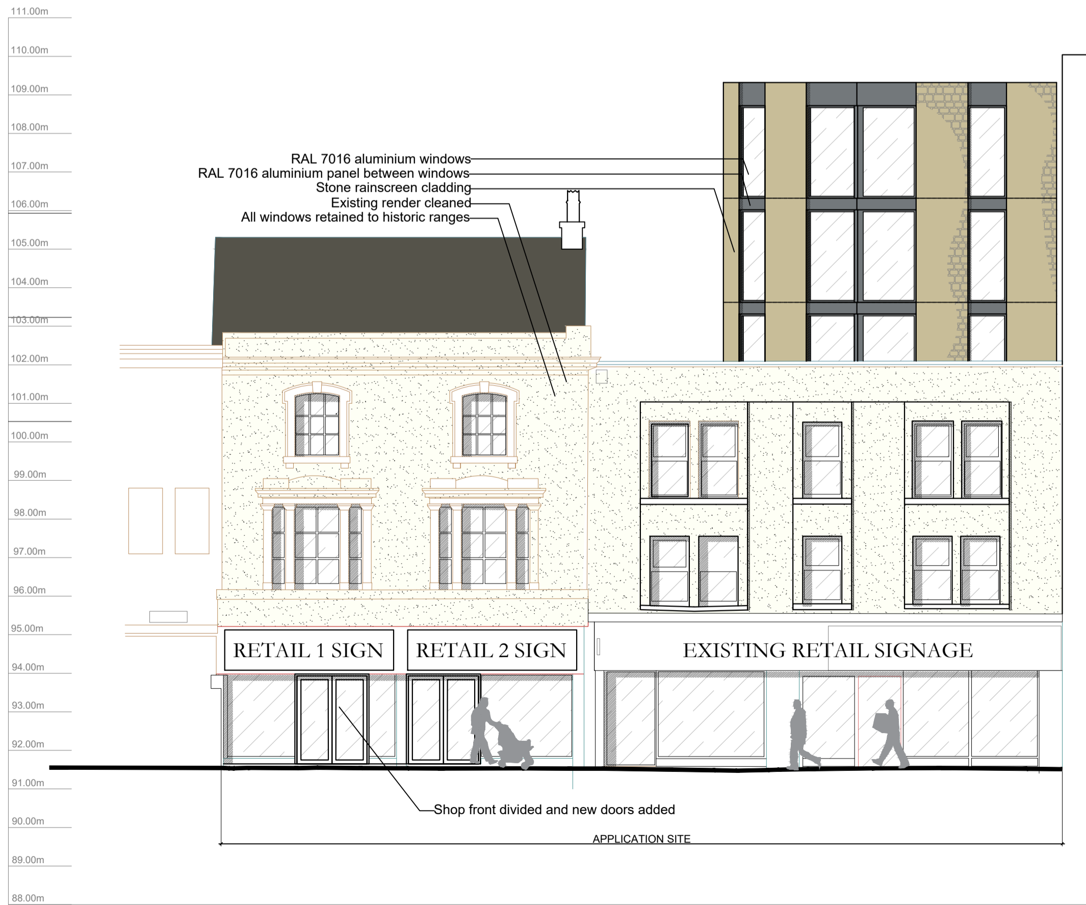
ELEVATION 3 - NEW STREET