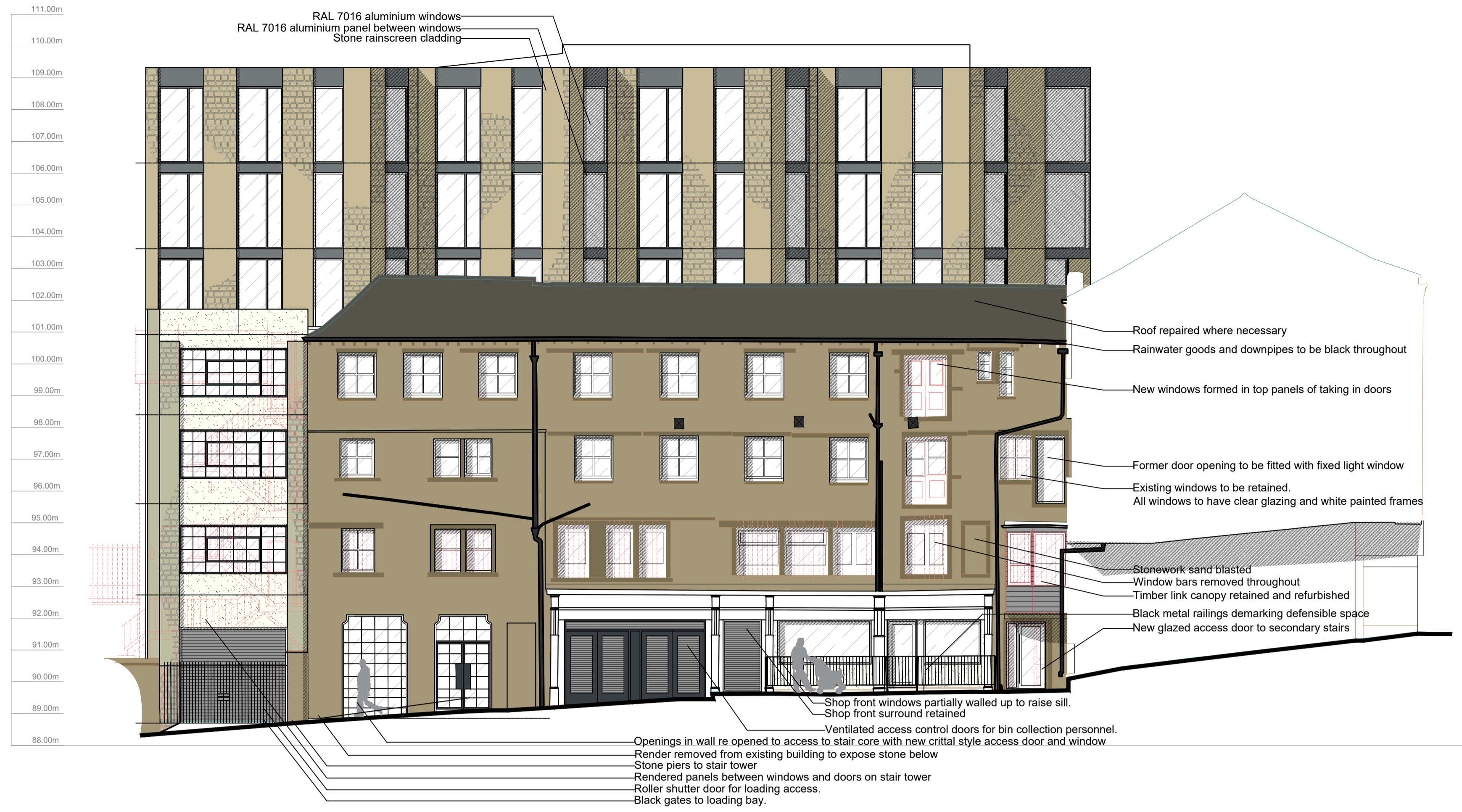
ELEVATION 1 - ALBERT YARD

Only figured dimensions should be used. Scaled dimensions should be checked with the Architect. This drawing together with the design, is the property and copyright of the Architect and must not be reproduced without written permission