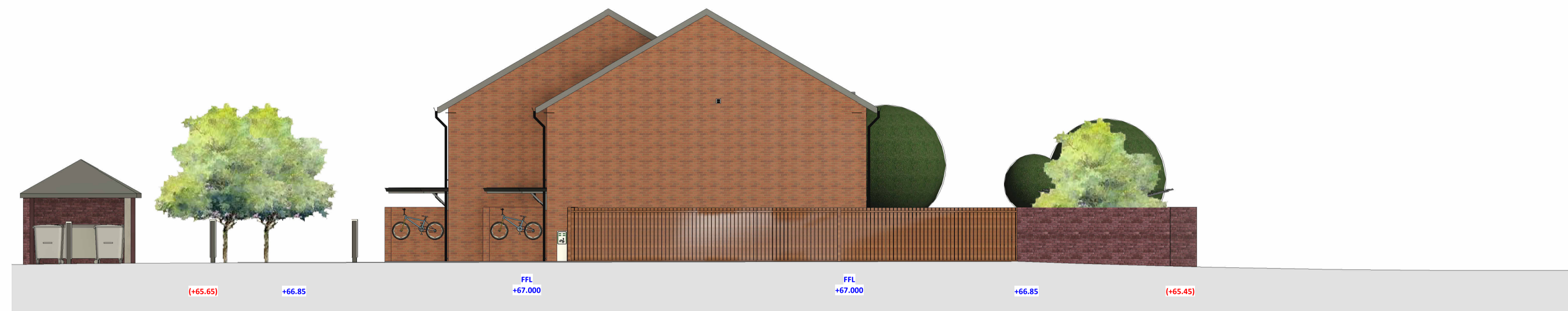
South West Elevation 1 : 100