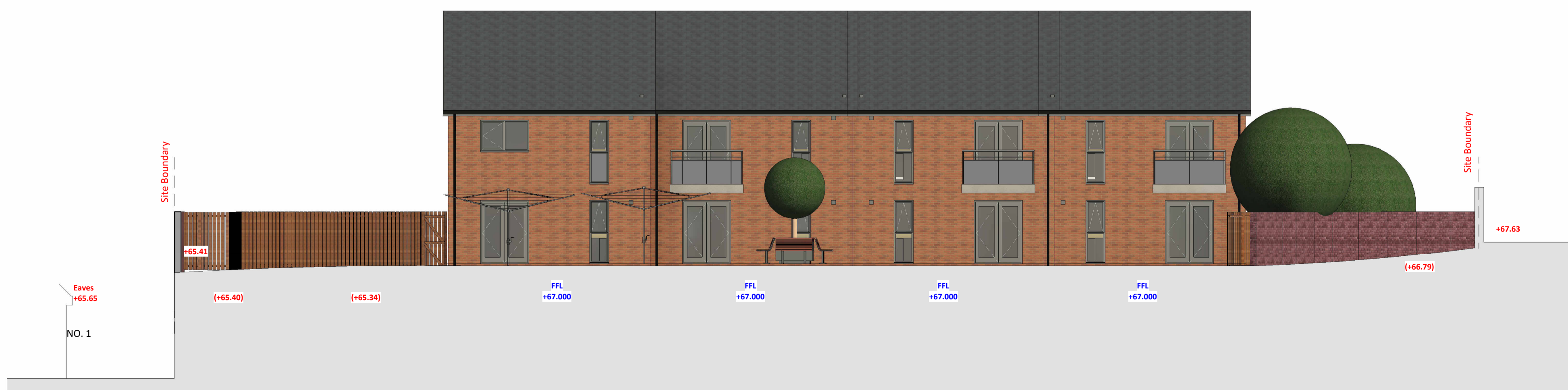
Southeast Elevation 1 : 100