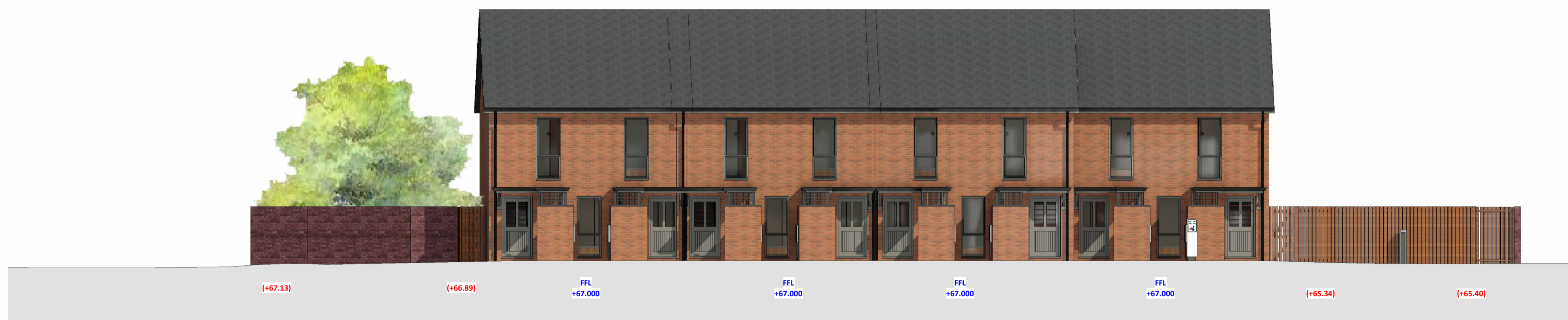
Northwest Elevation 1 : 100