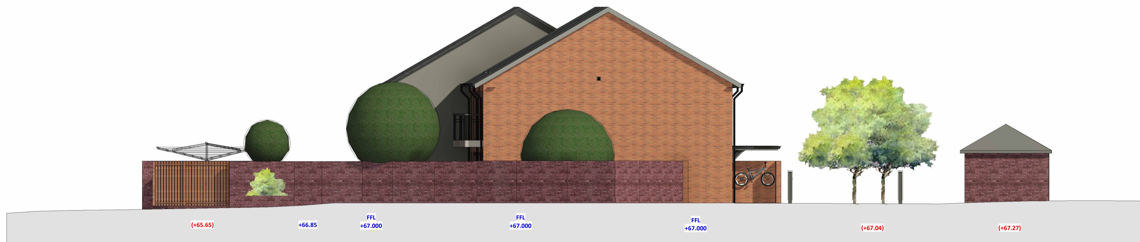
Northeast Elevation 1 : 100