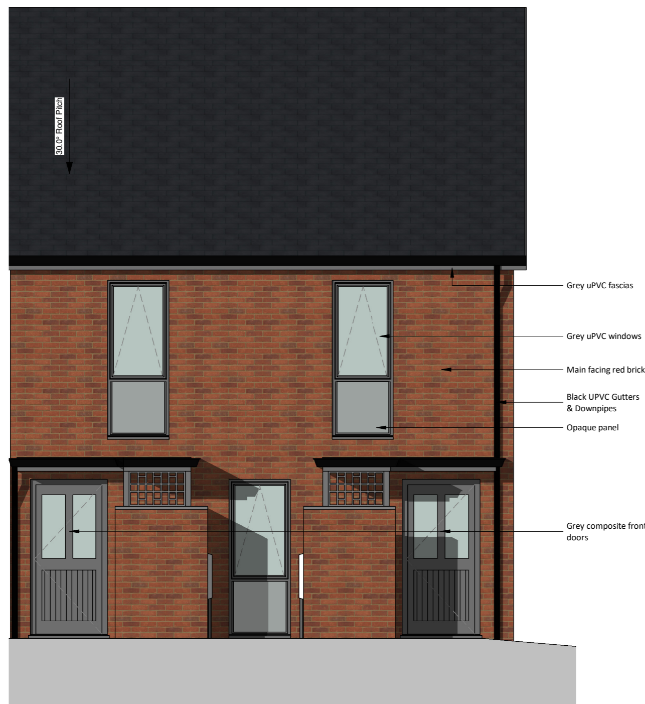
10 Front Elevation 1 : 50