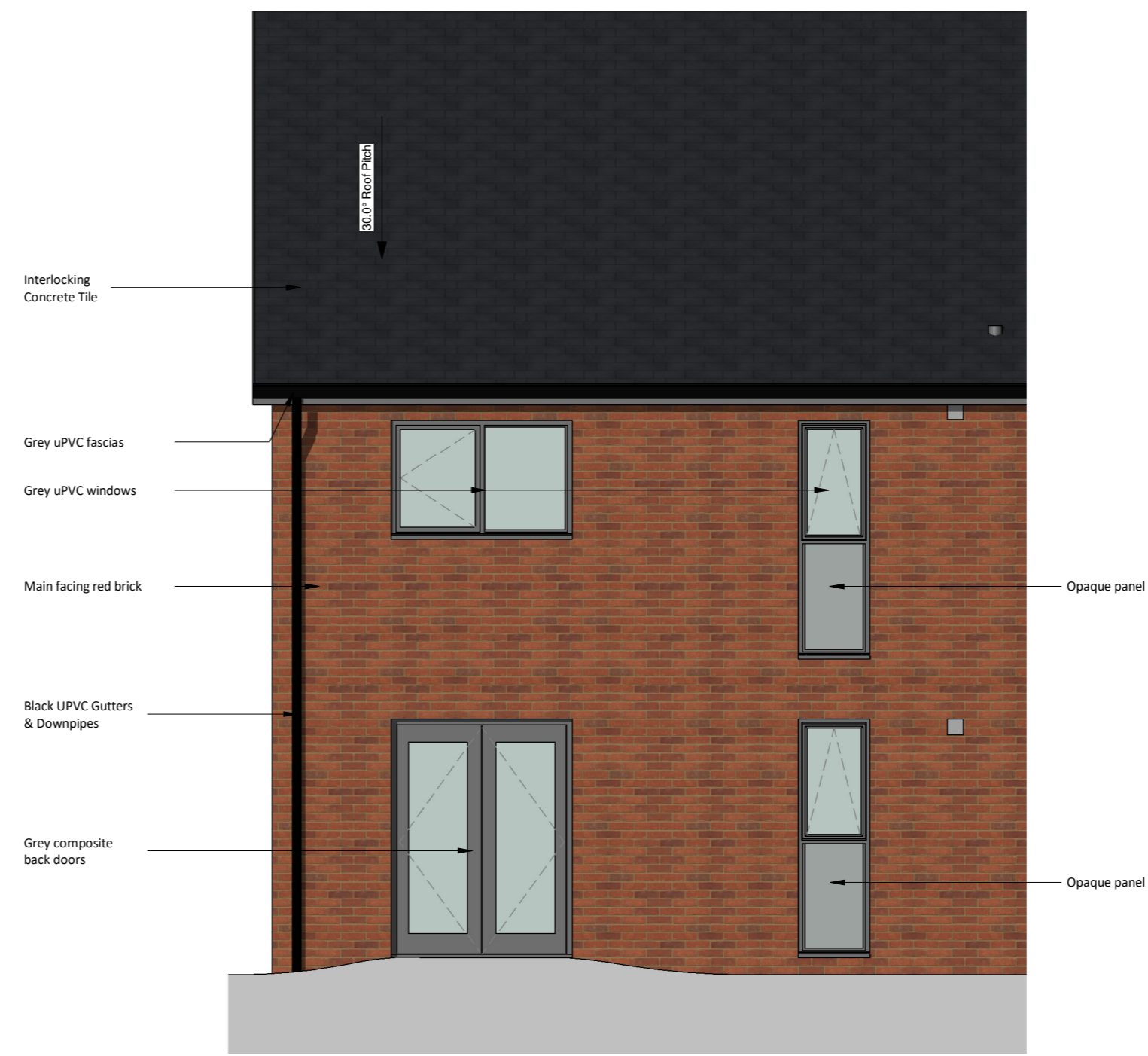
11 Rear Elevation 1 : 50