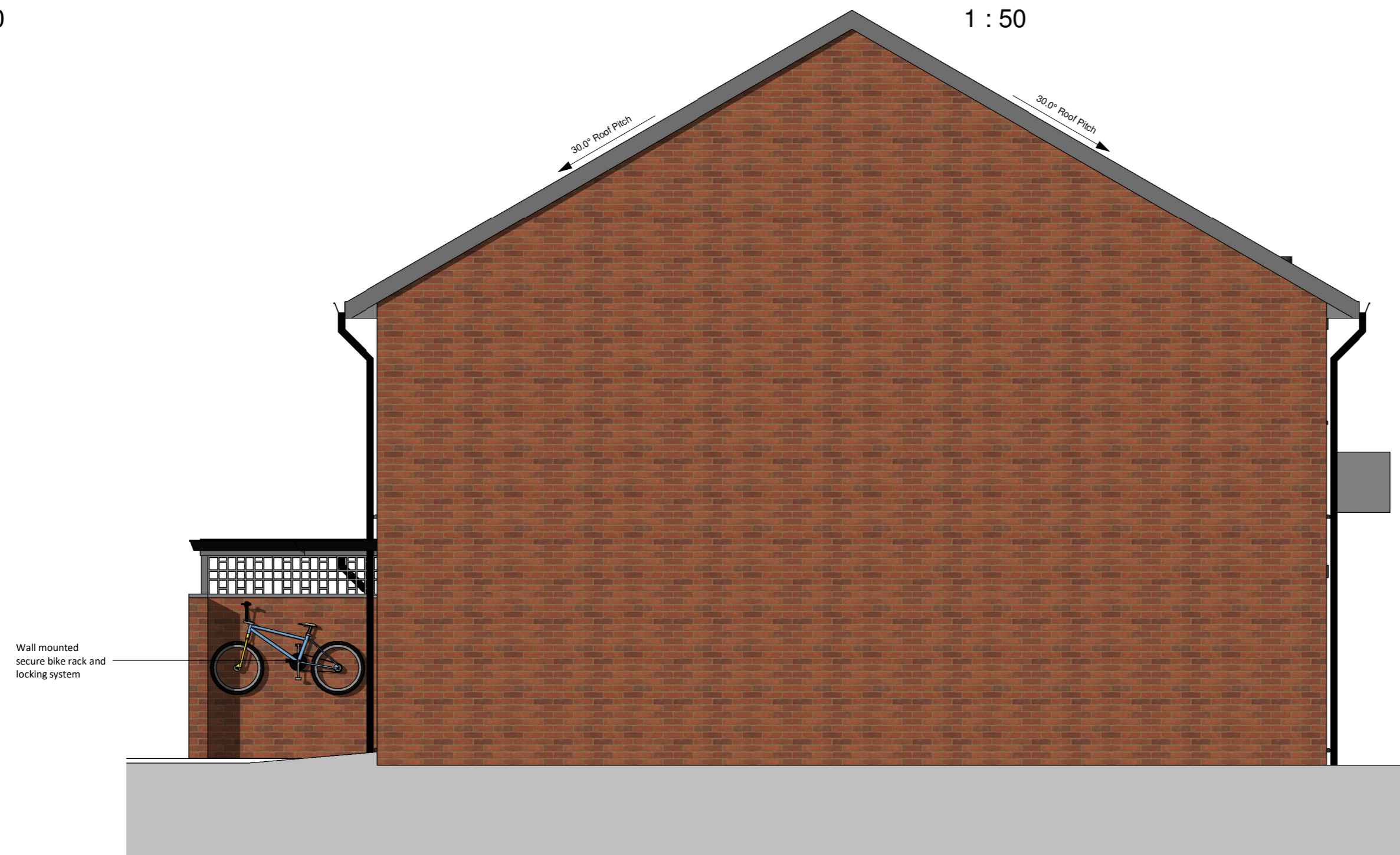
12 Gable Elevation 1 : 50