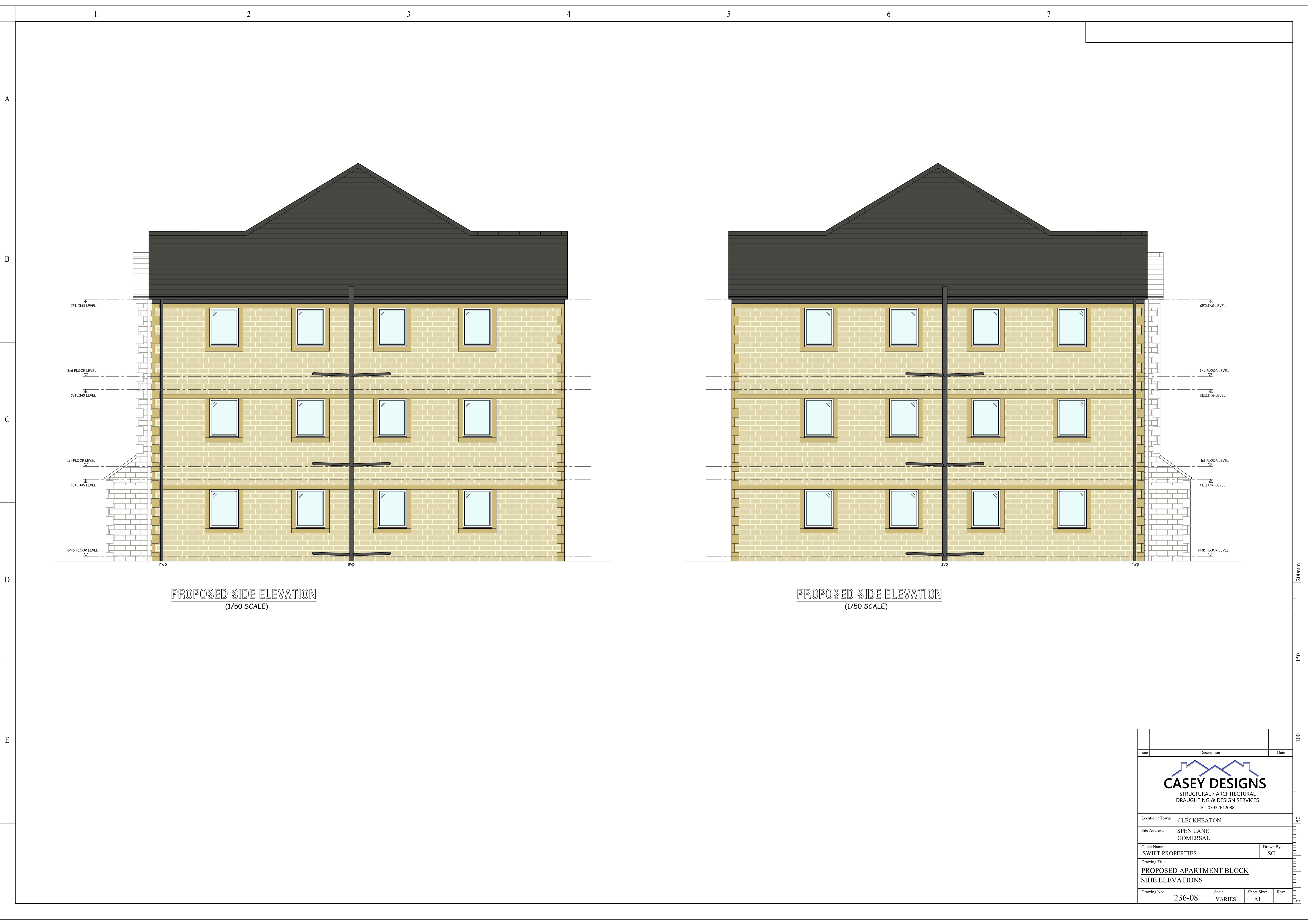
PROPOSED SIDE ELEVATION (1/50 SCALE)