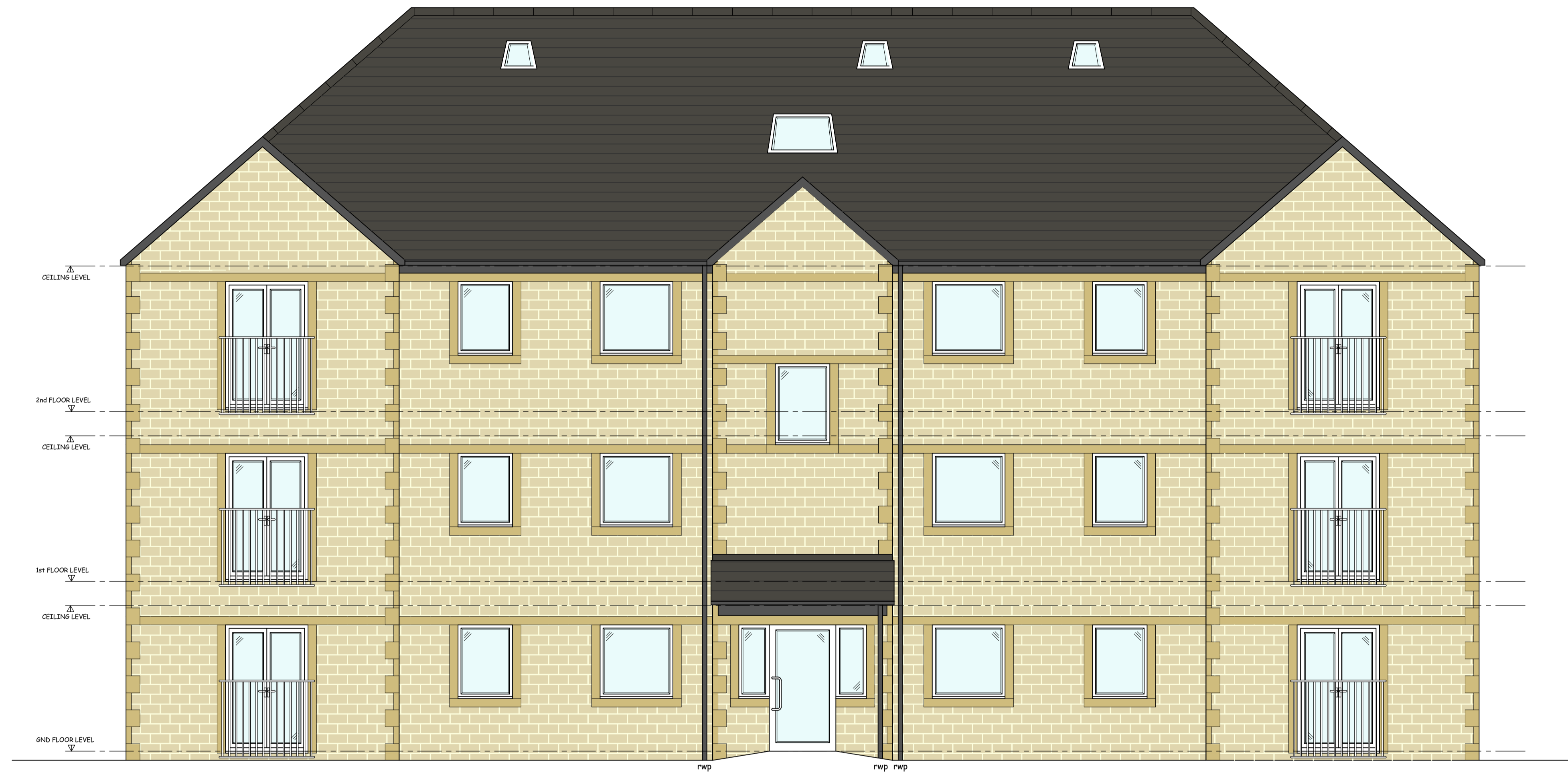
PROPOSED FRONT ELEVATION (1/50 SCALE)