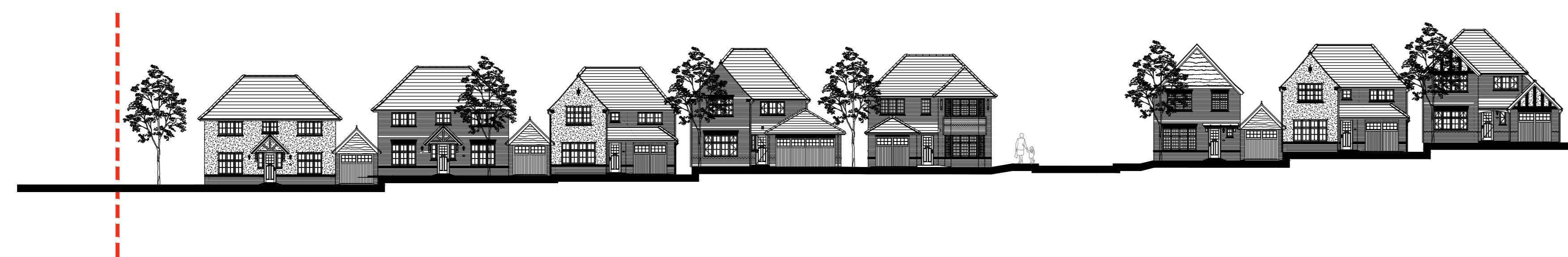
SECTION B-B SCALE 1:250