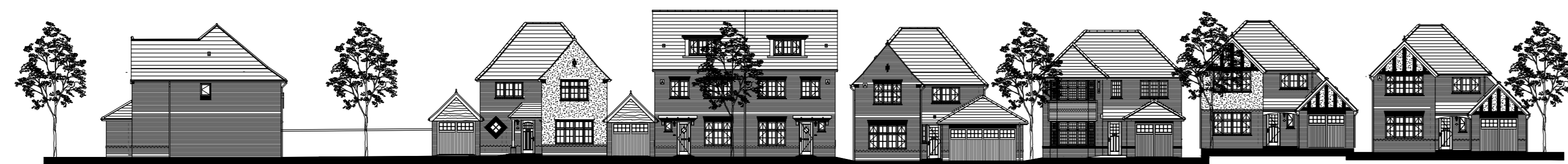
SECTION A-A SCALE 1:250