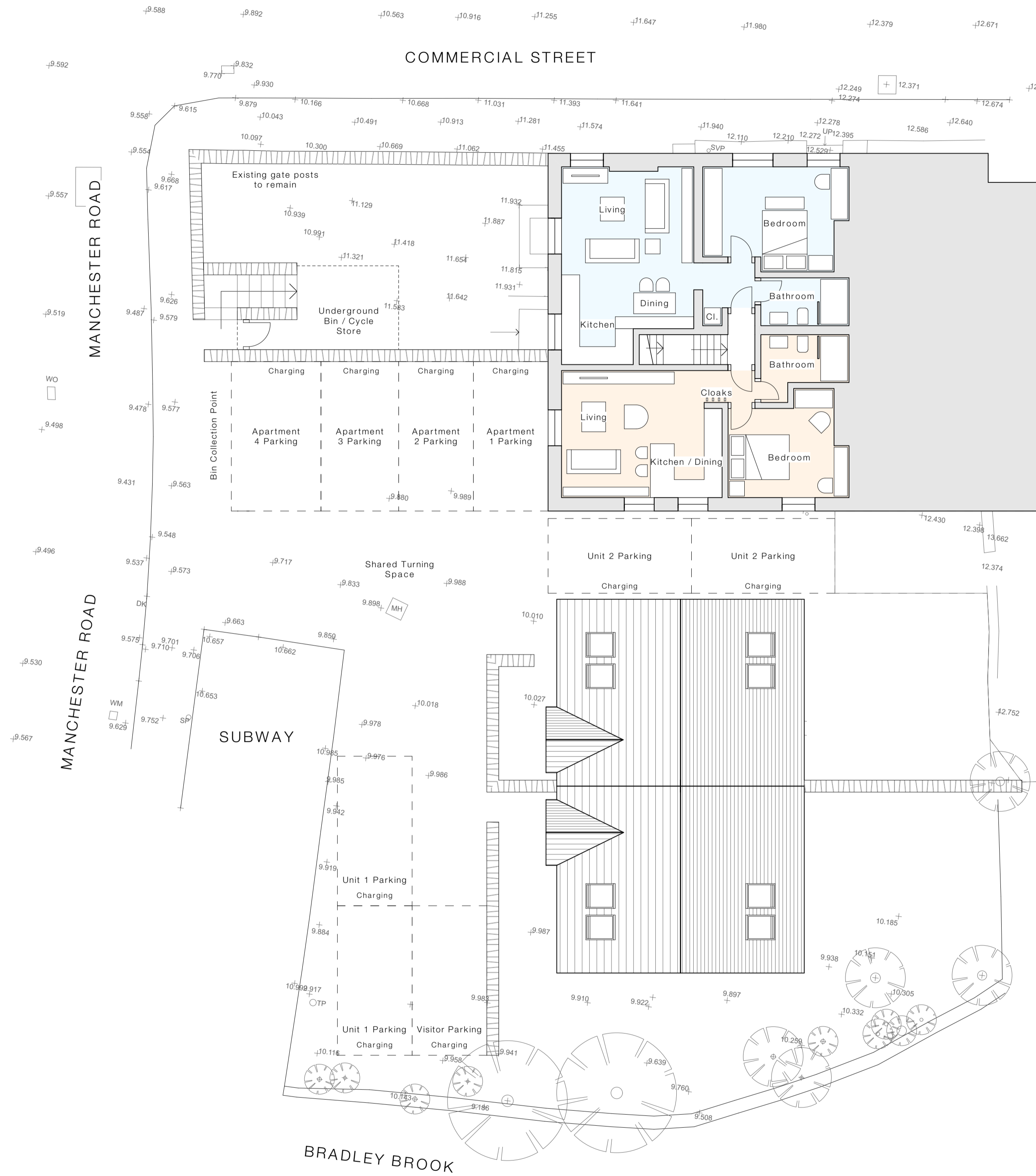
Proposed Second Floor Site Plan 1:100