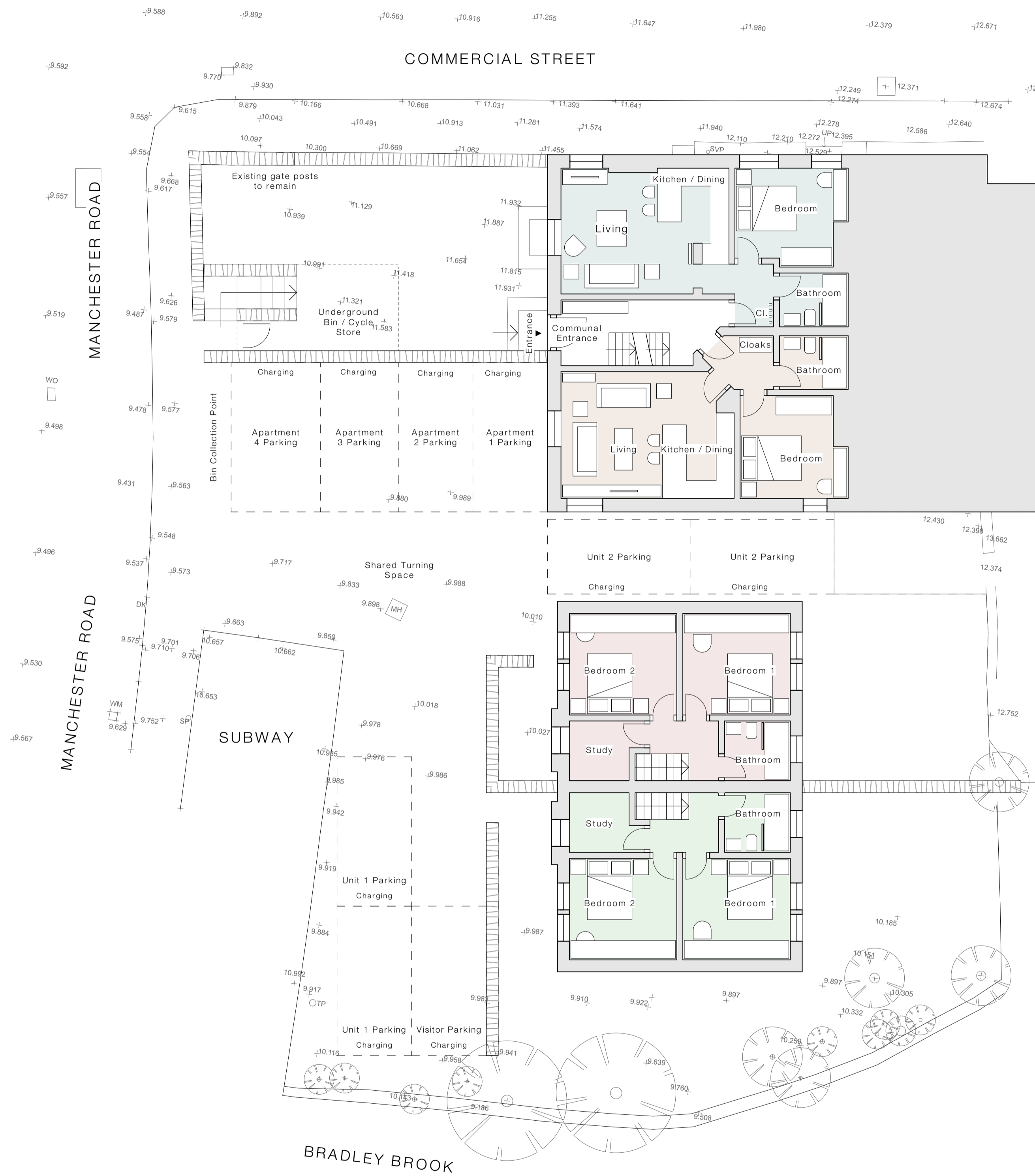
Proposed First Floor Site Plan 1:100