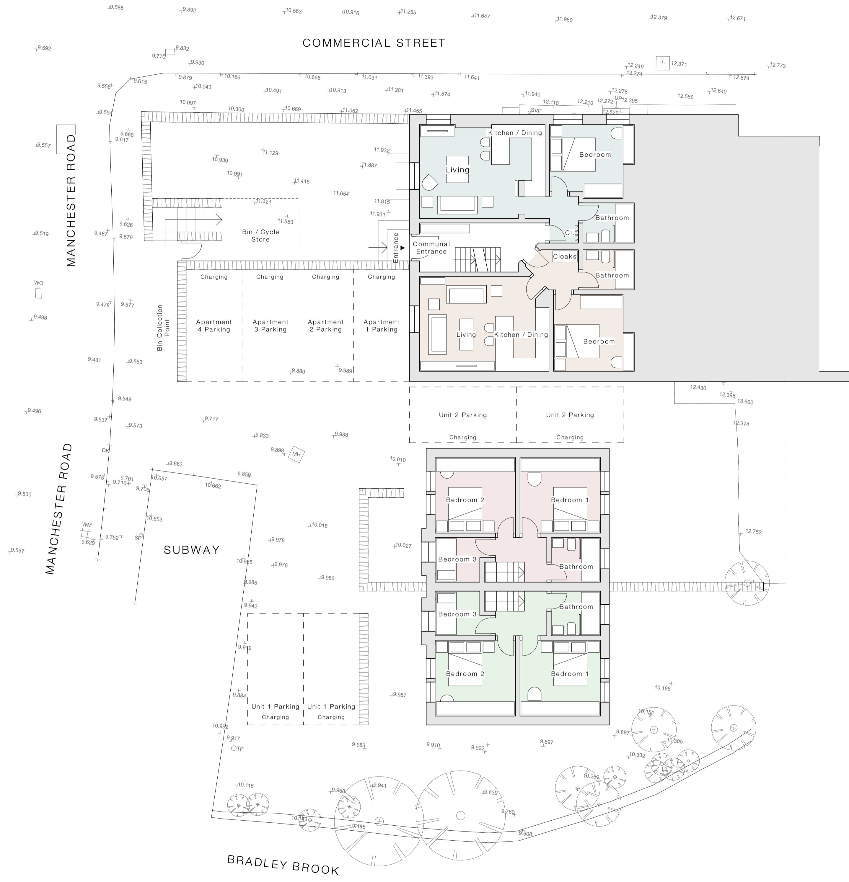
Proposed First Floor Site Plan 1:100