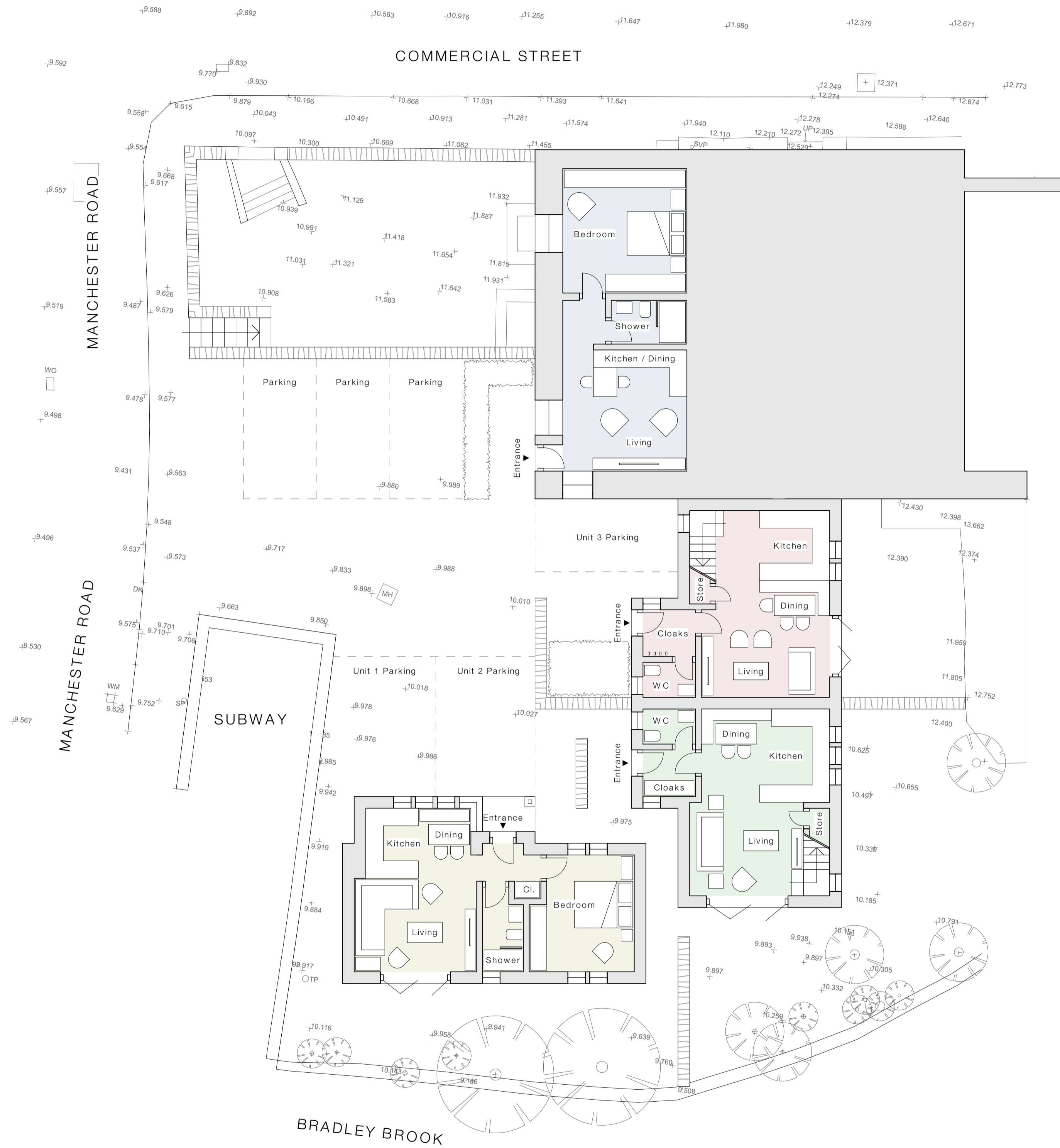
Proposed Ground Floor Site Plan 1:100