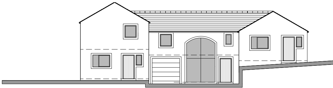
PREVIOUSLY APPROVED NORTH EAST ELEVATION