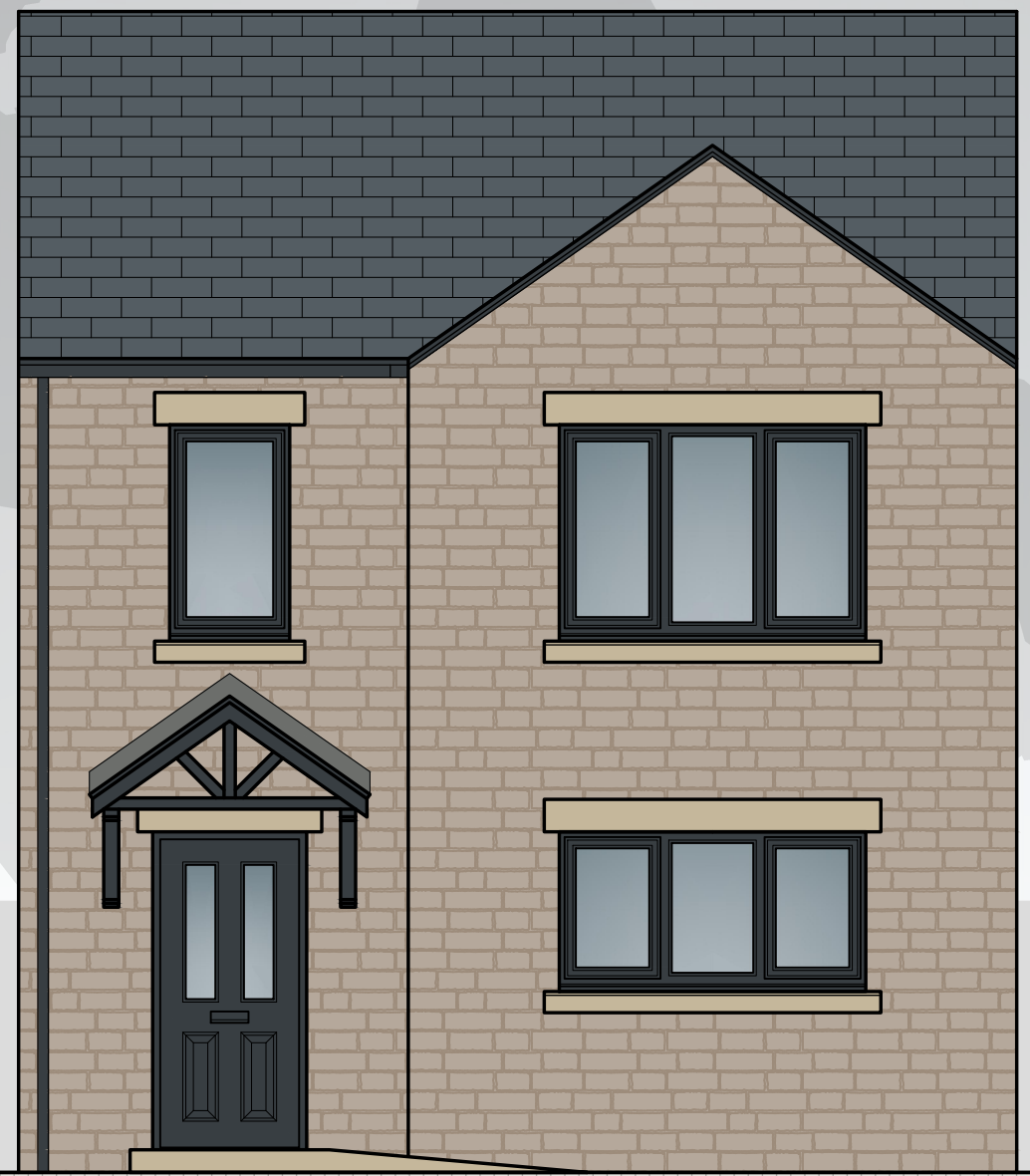
02 Proposed Front Elevation 52 Scale 1:50 @ A3

PLEASE NOTE, THIS DRAWING SHOWS A SINGLE INSTANCE OF THE HOUSE TYPE. PLEASE REFER TO SITE PLAN / STREET SCENE ELEVATIONS FOR ON-SITE CONFIGURATION AS THIS TYPE FORMS PART OF SEMI-DETACHED BLOCKS