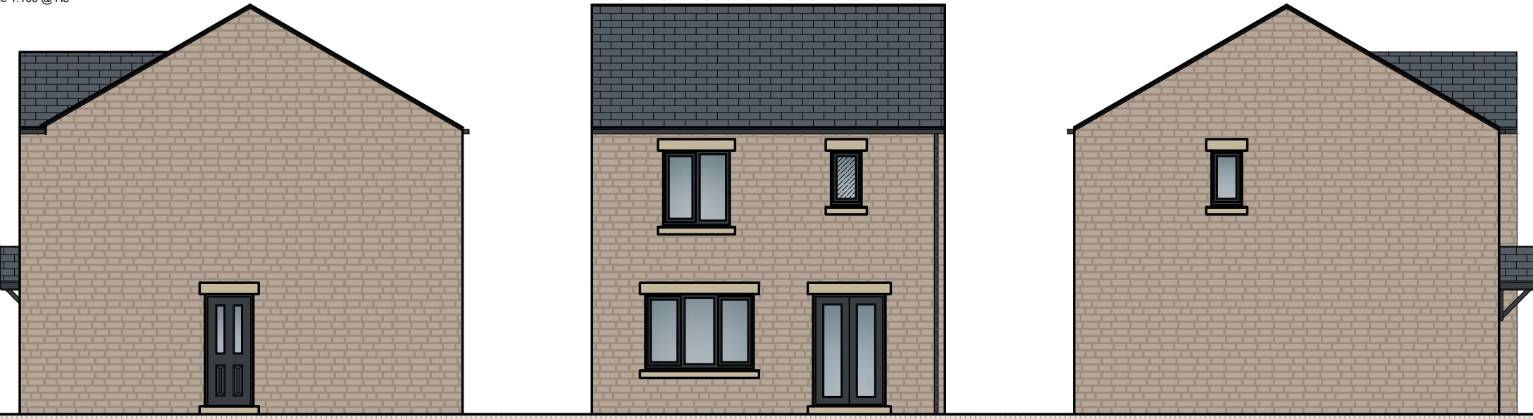
03 Proposed Side and Rear Elevations 52 Scale 1:100 @ A3

PLEASE NOTE, THIS DRAWING SHOWS A SINGLE INSTANCE OF THE HOUSE TYPE. PLEASE REFER TO SITE PLAN / STREET SCENE ELEVATIONS FOR ON-SITE CONFIGURATION AS THIS TYPE FORMS PART OF SEMI-DETACHED BLOCKS