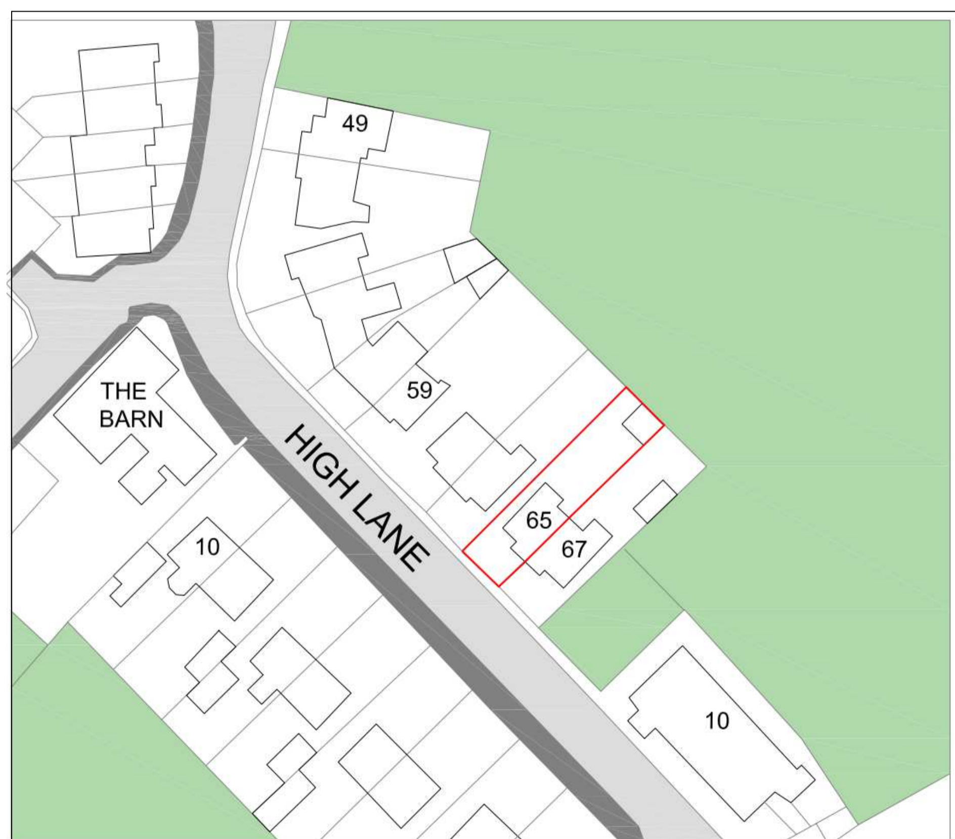
1 LOCATION PLAN 1 : 500