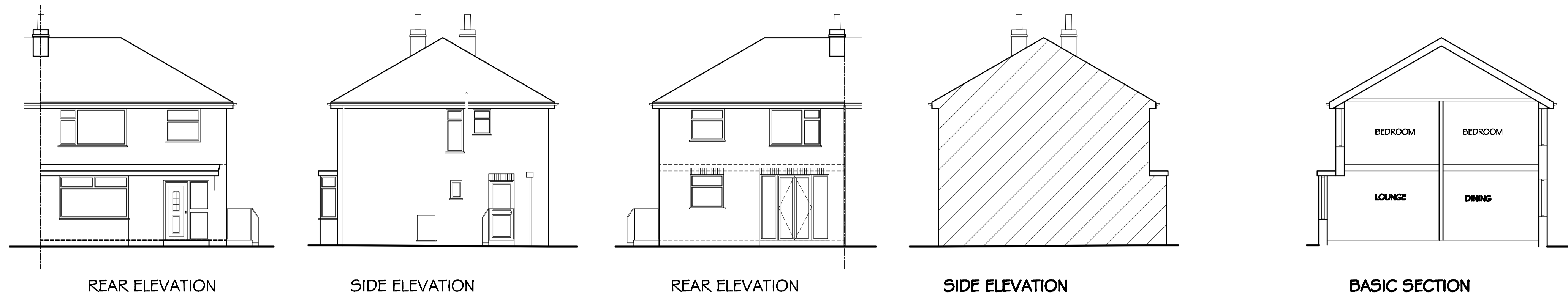
ELEVATIONS & BASIC SECTION SCALE 1:100