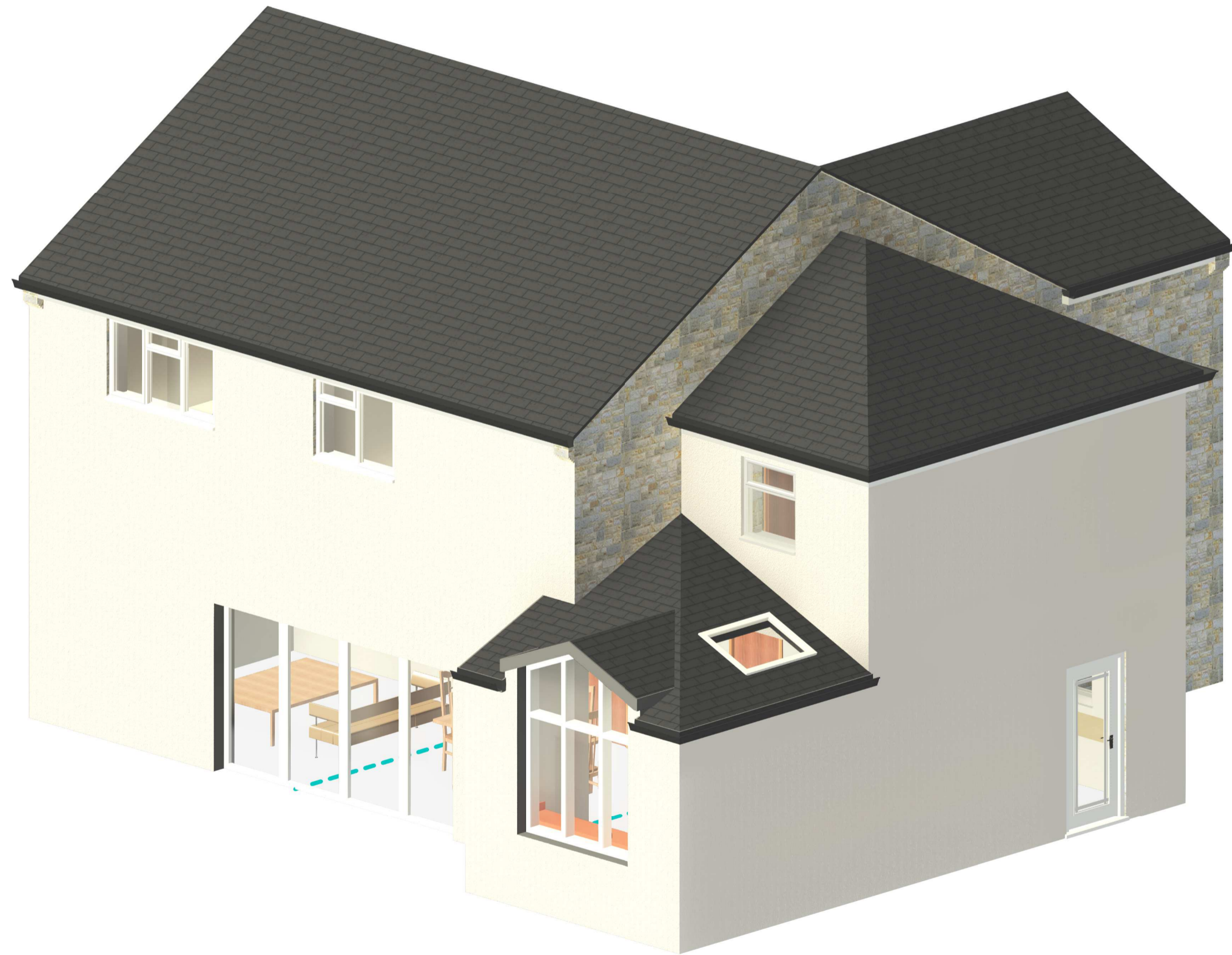
AERIAL PERSPECTIVE THREE