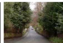
Photo 19. View north along Bryan Road