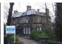
Photo 20. Bryan Wood along Bryan Rd, currently in use as a nursing home