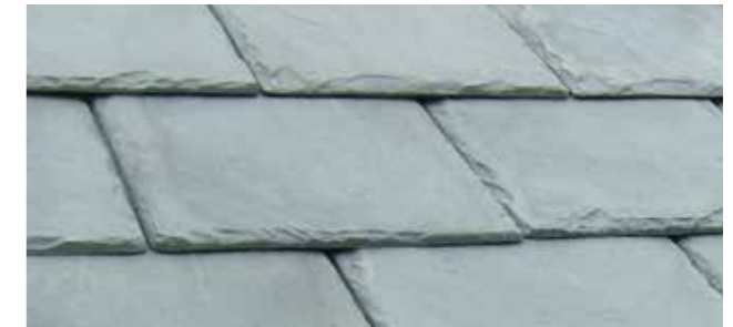
Greys Artstone GRC Slate (Glassfibre Reinforced Concrete)

Our slates are constructed from Glassfibre Reinforced Concrete (GRC). Construction allows easy cutting without cracking or breaking. Our slates weather like stone not concrete, unlike aggregate based concrete products that can show aggregate through their surface due to weathering over time.