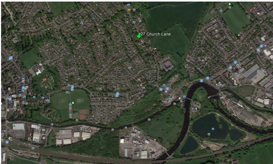
Figure 1: Aerial Location Plan

lie in the front portion of the site. A further two trees adjacent to the site at 27a Church Lane are also afforded the same protection.