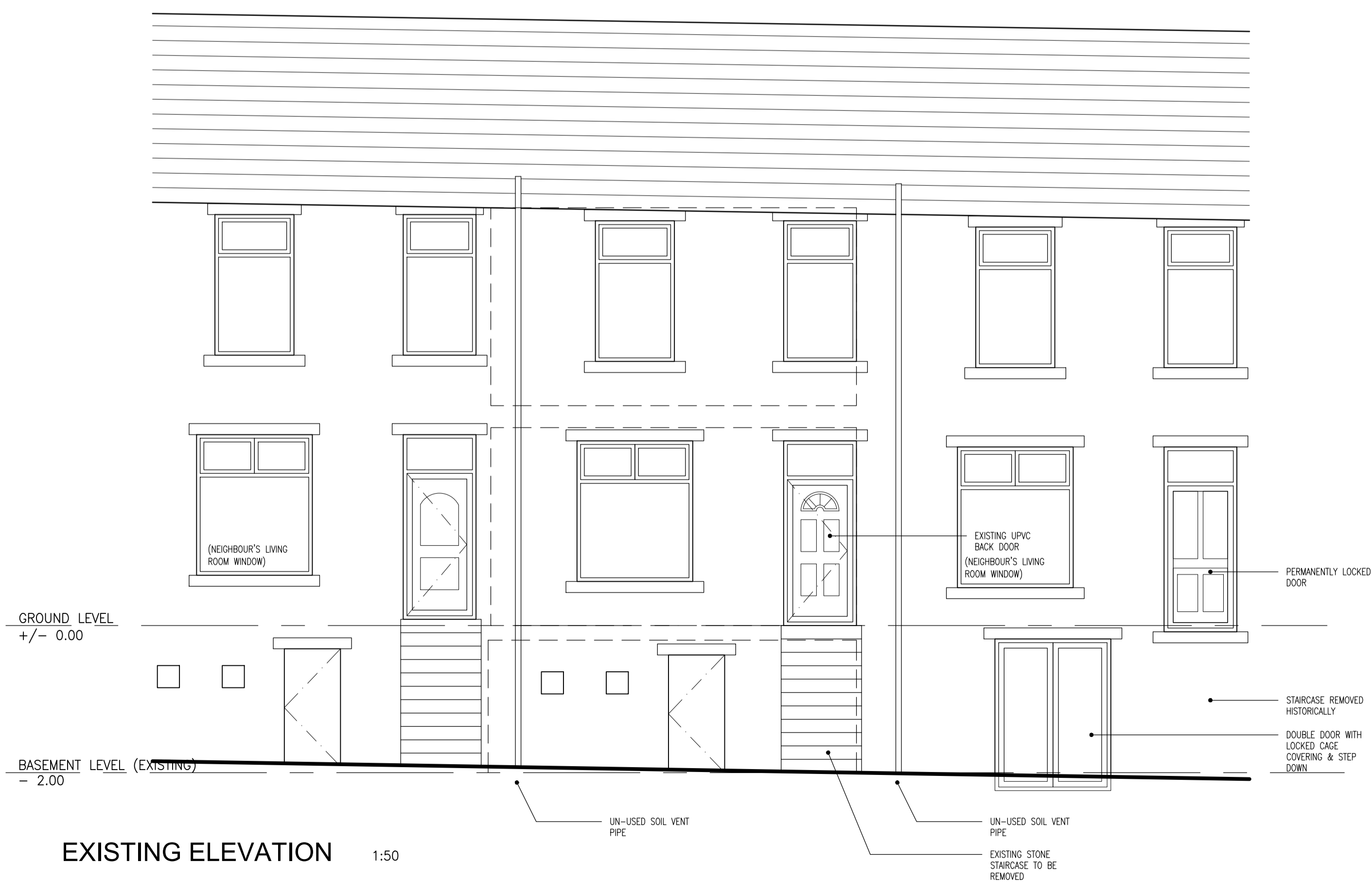
EXISTING ELEVATION 1:50