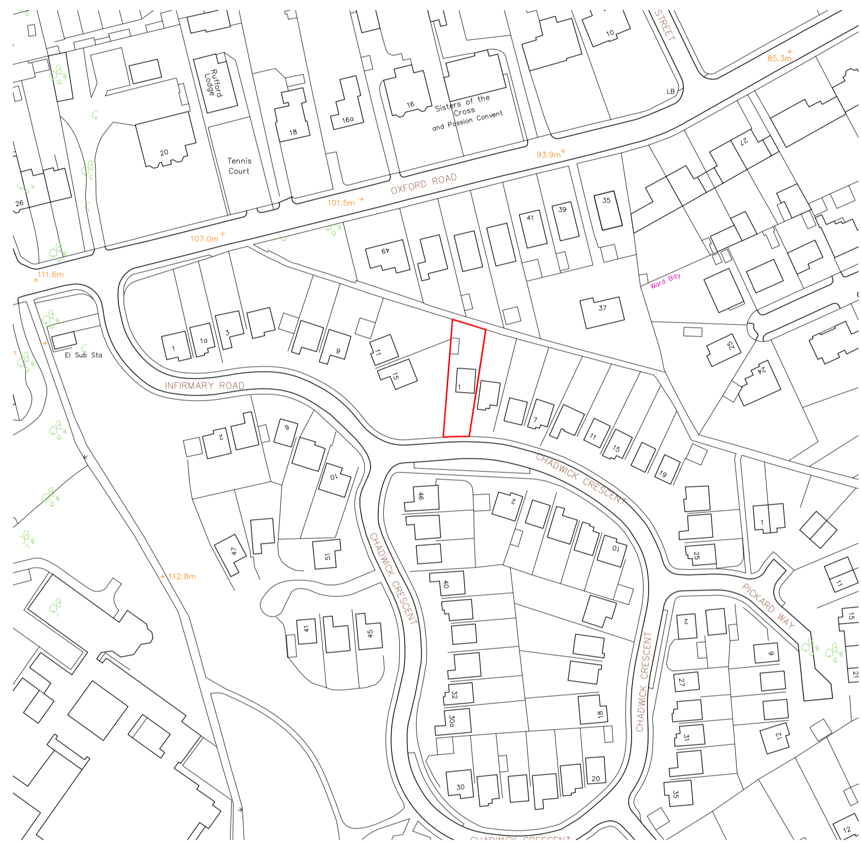
LOCATION PLAN Scale 1:1250@A1