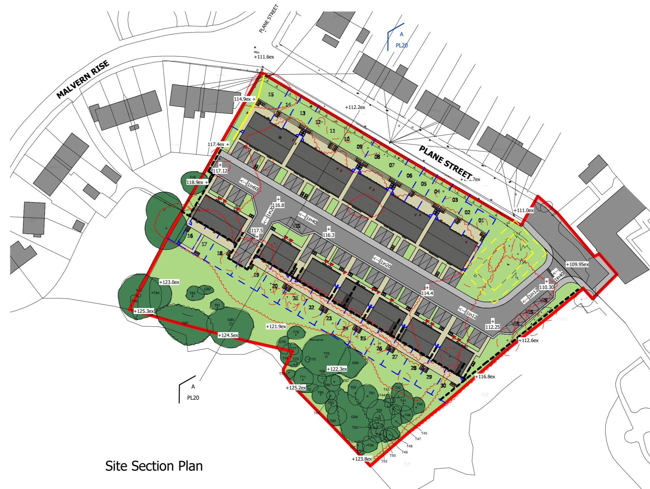
Site Section Plan

P1 25.06.20 MAI RPM Section updated to suit site plan amendments.