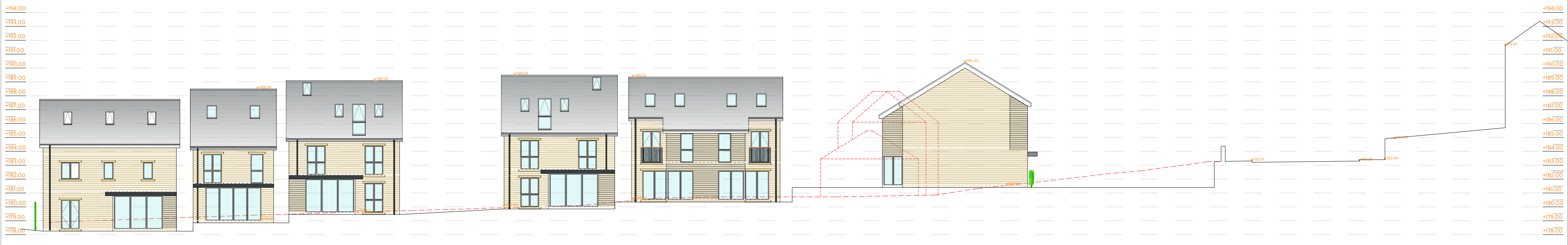
SECTION B-B 1:200