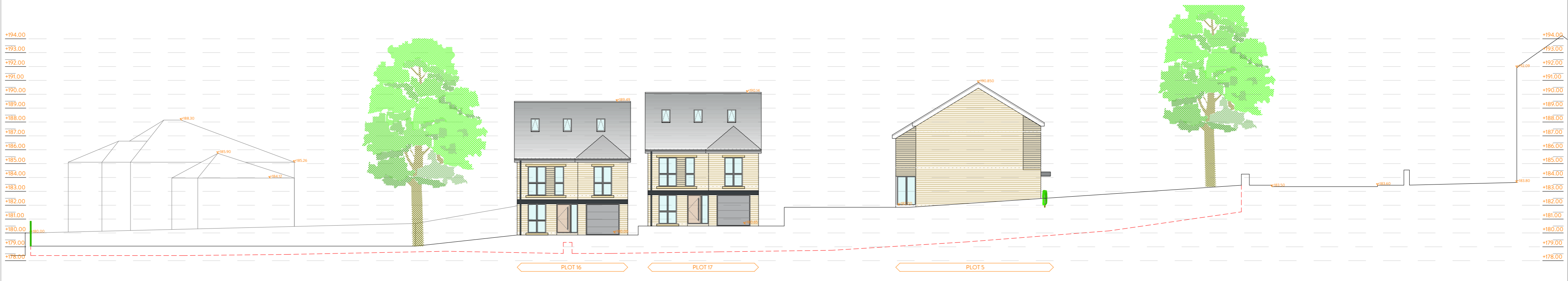
SECTION A-A 1:200