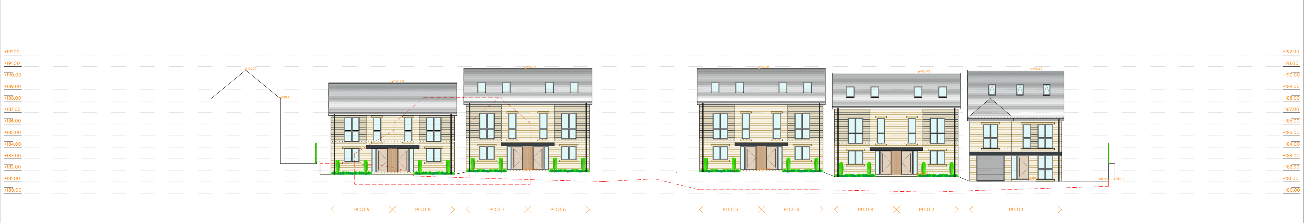
SECTION E-E 1:200