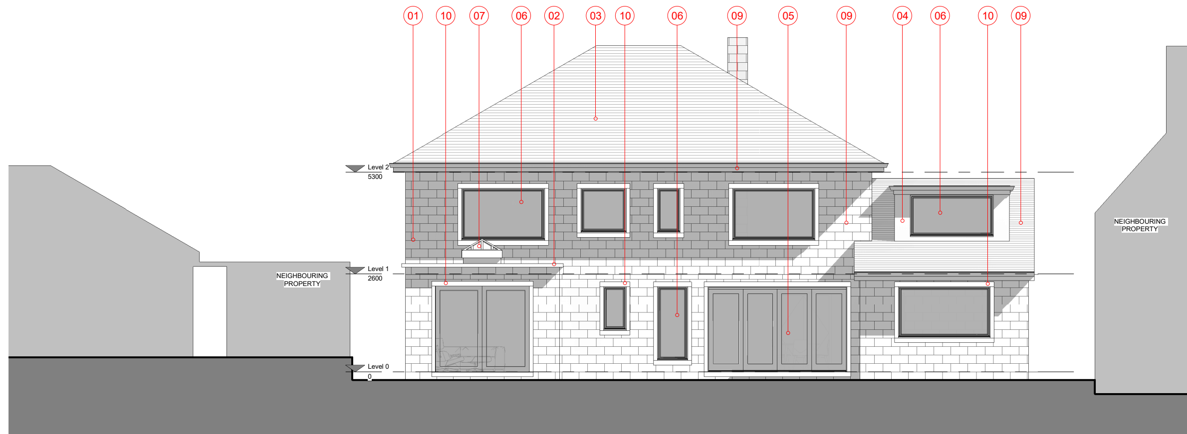
South Elevation 1 : 50