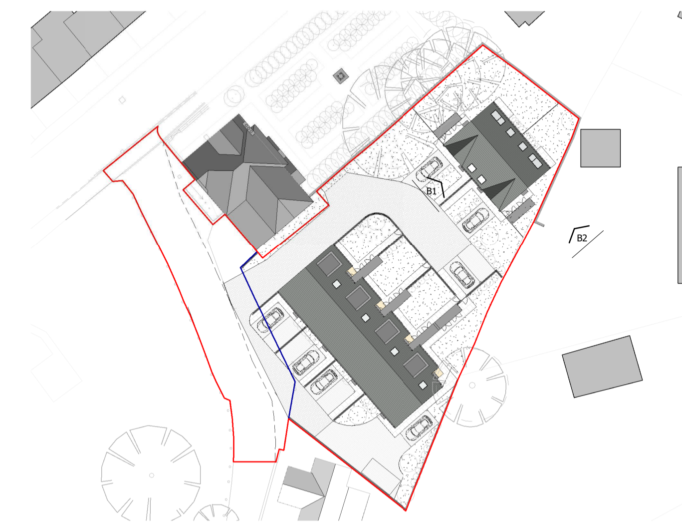
elevation key plan 1 : 500