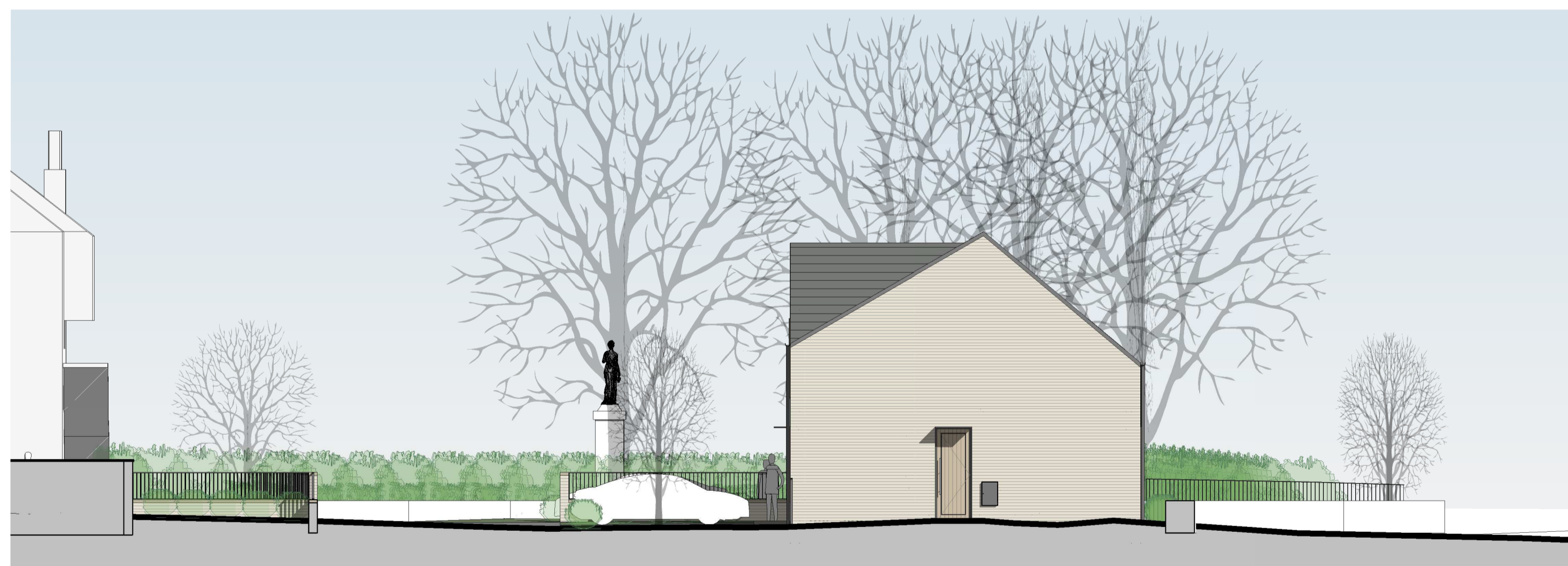
B2 | elevation B 2 1 : 100