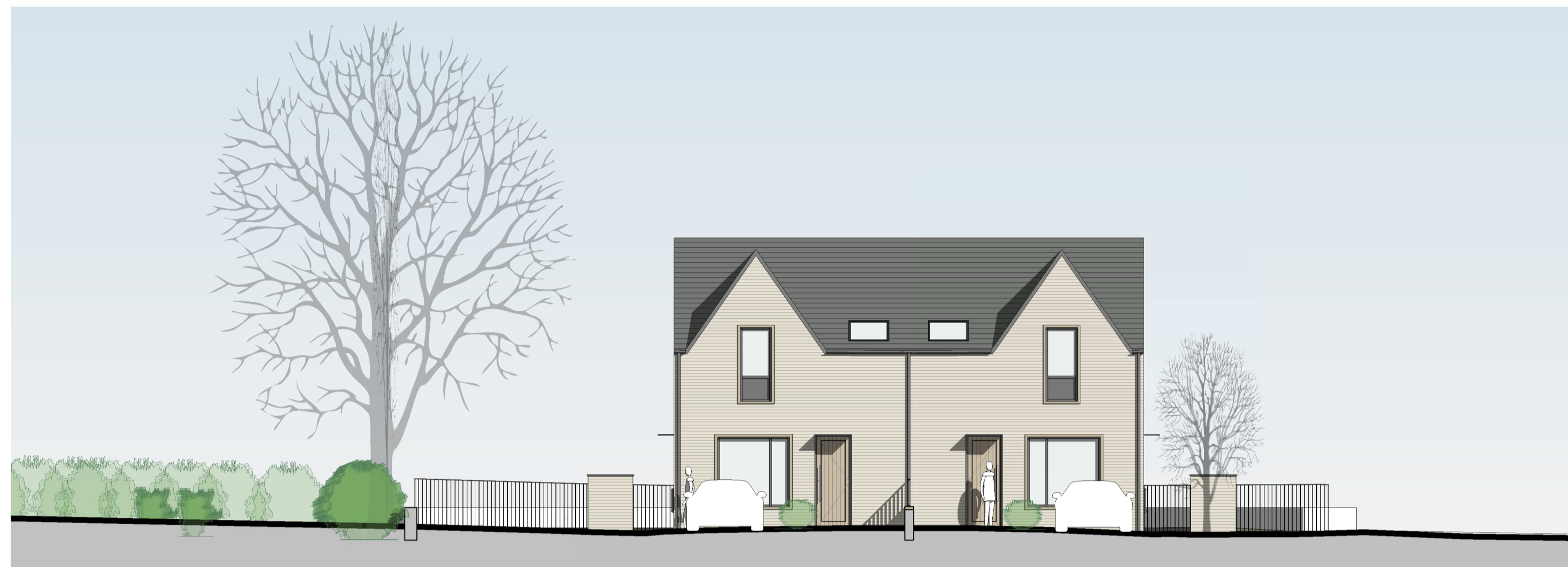
B1 | elevation B 1 1 : 100