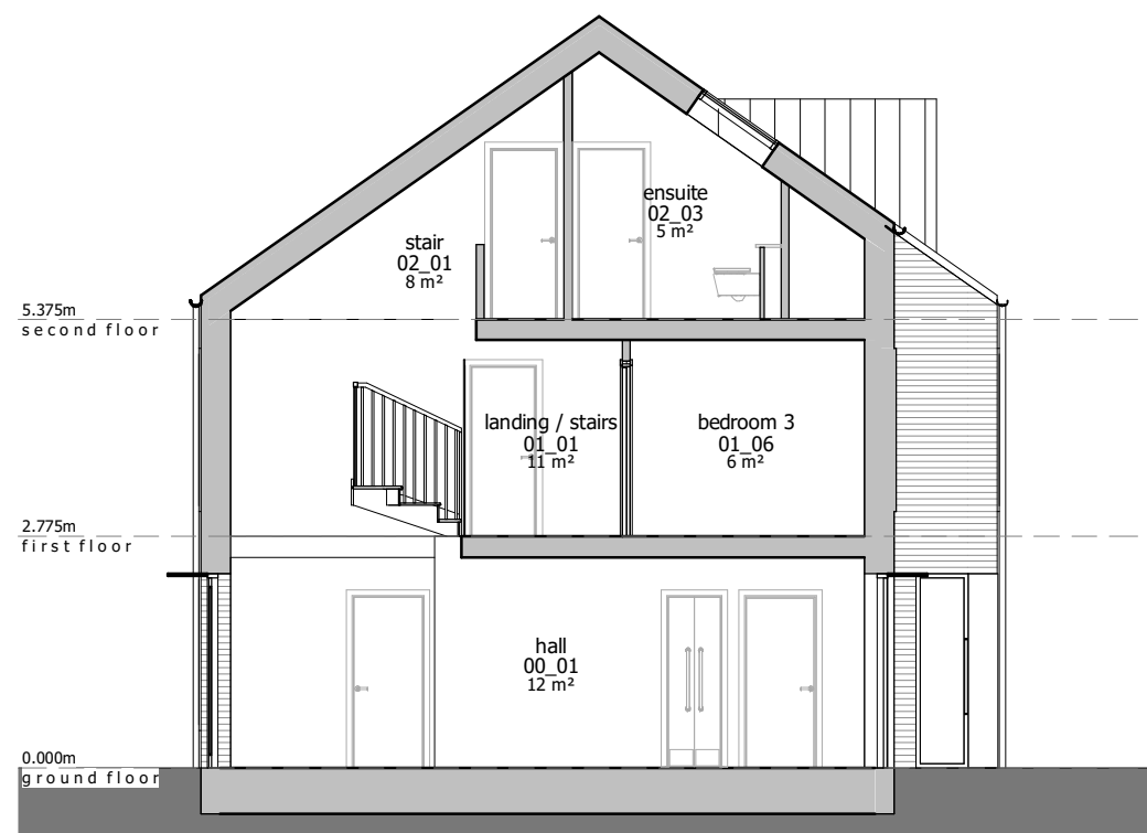
B | section B 1 : 100