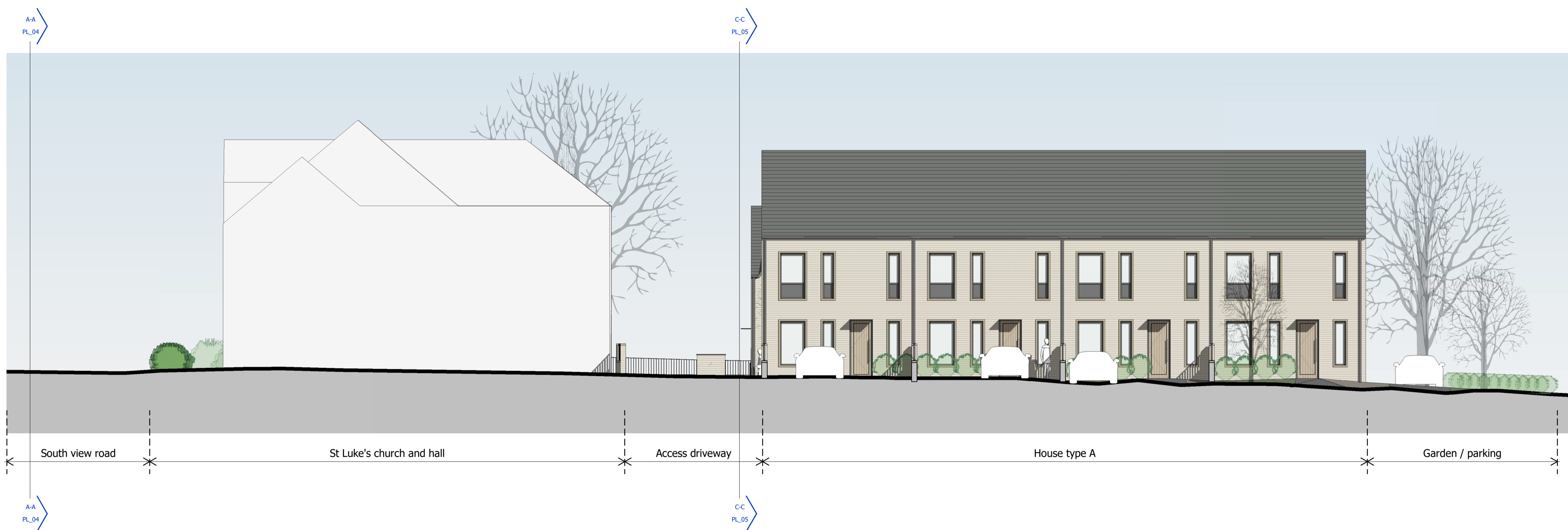
B-B | section B-B 1 : 100