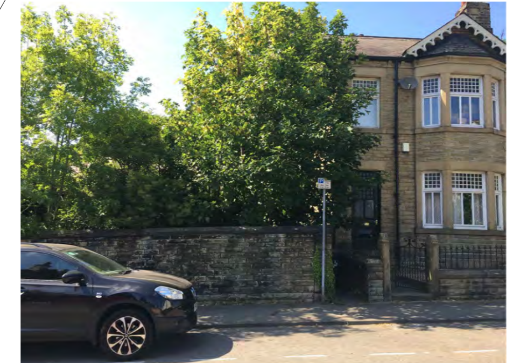
St Paul's Road existing tall stone wall.