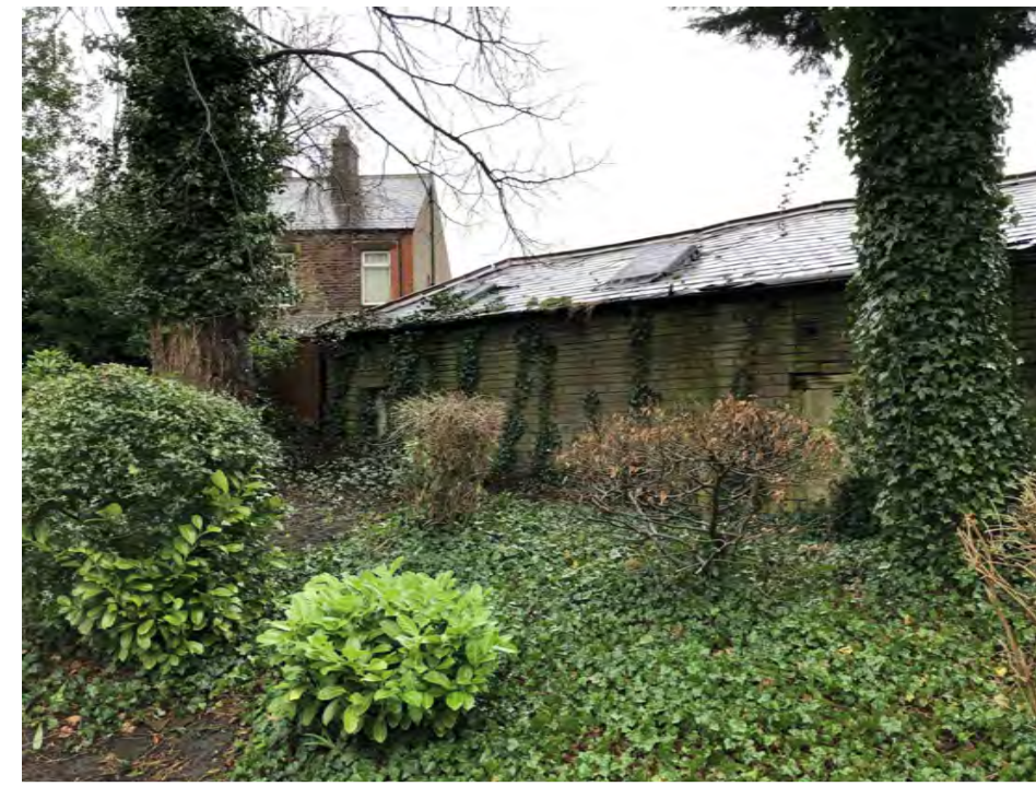
Existing boundary property and Park landscaping