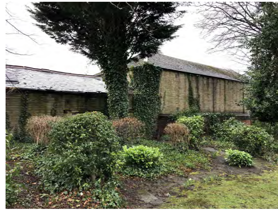
Existing boundary property and Park landscaping