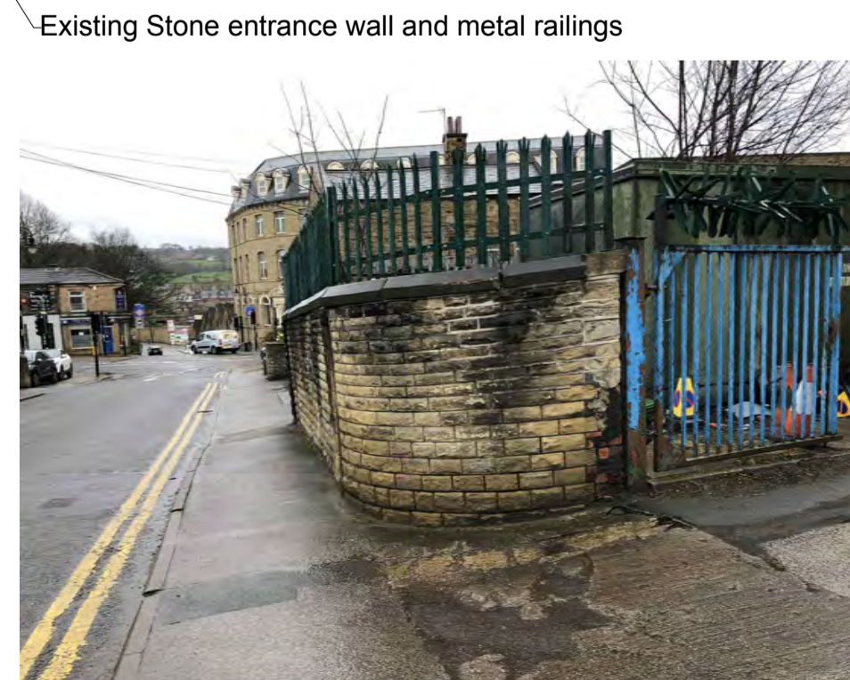
Existing Stone entrance wall and metal railings