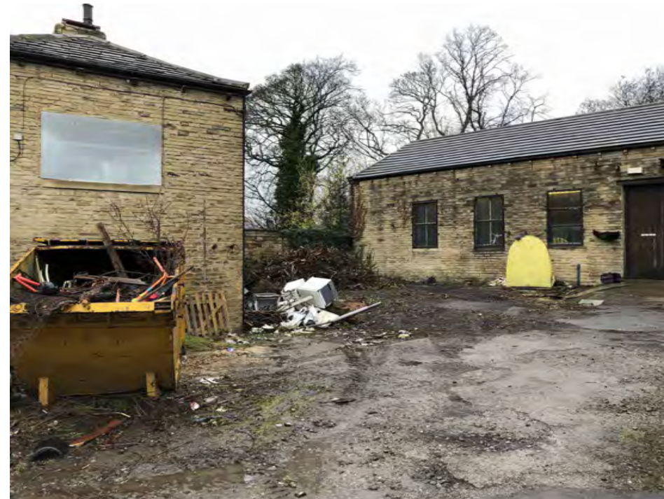
Existing stone boundary wall and existing boundary properties