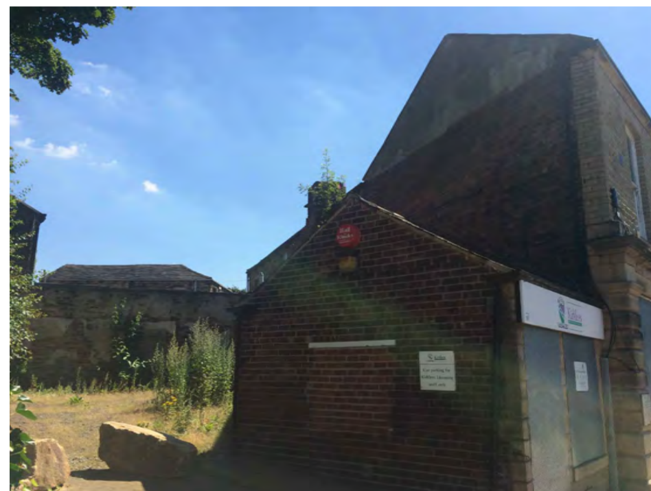
View to external yard from main road, Existing stone boundary wall.