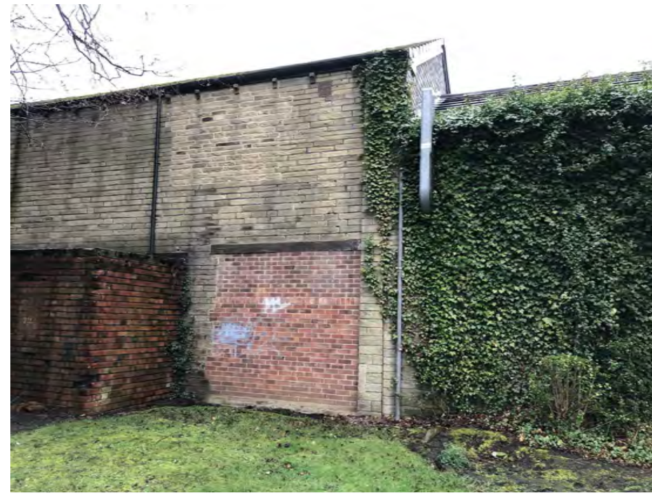
Existing boundary properties