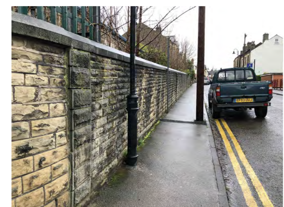
St Paul's Road top of existing stone wall, overgrown vegetation and external building wall.