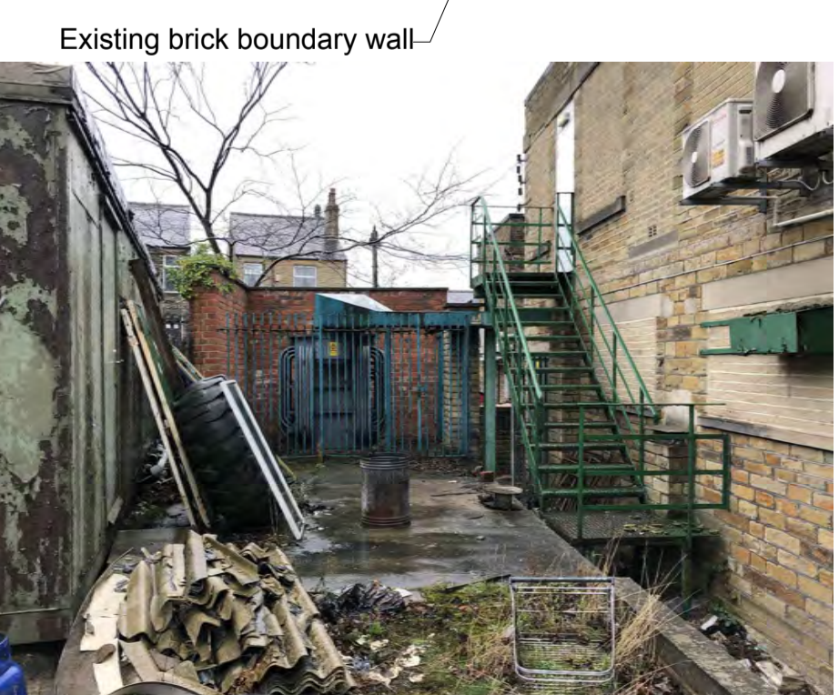
Existing brick boundary wall