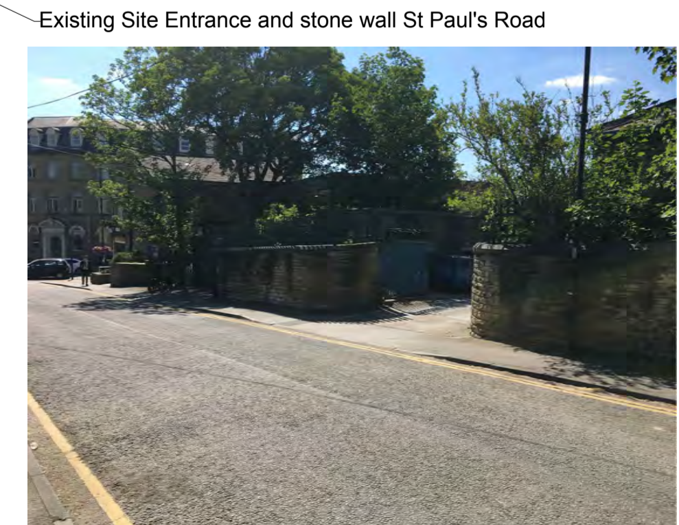
Existing Site Entrance and stone wall St Paul's Road

REV: A DATE: 05/12/19 DRAWN: AH CHECKED: MH Red line site boundary amended following councils confirmation.