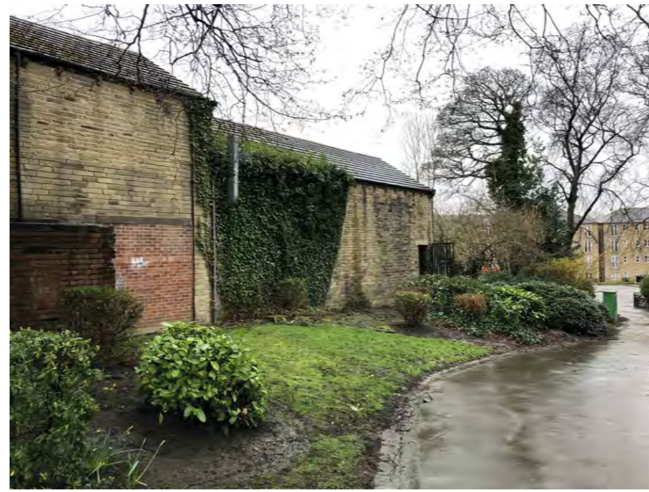
Existing boundary properties and soft landscaping