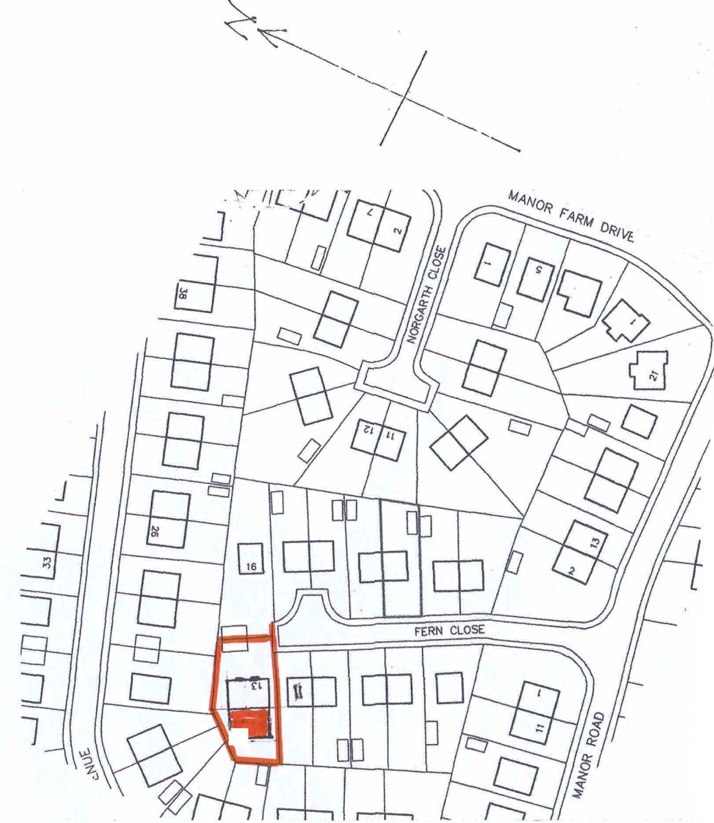
LOCATION PLAN 1 : 1250 th