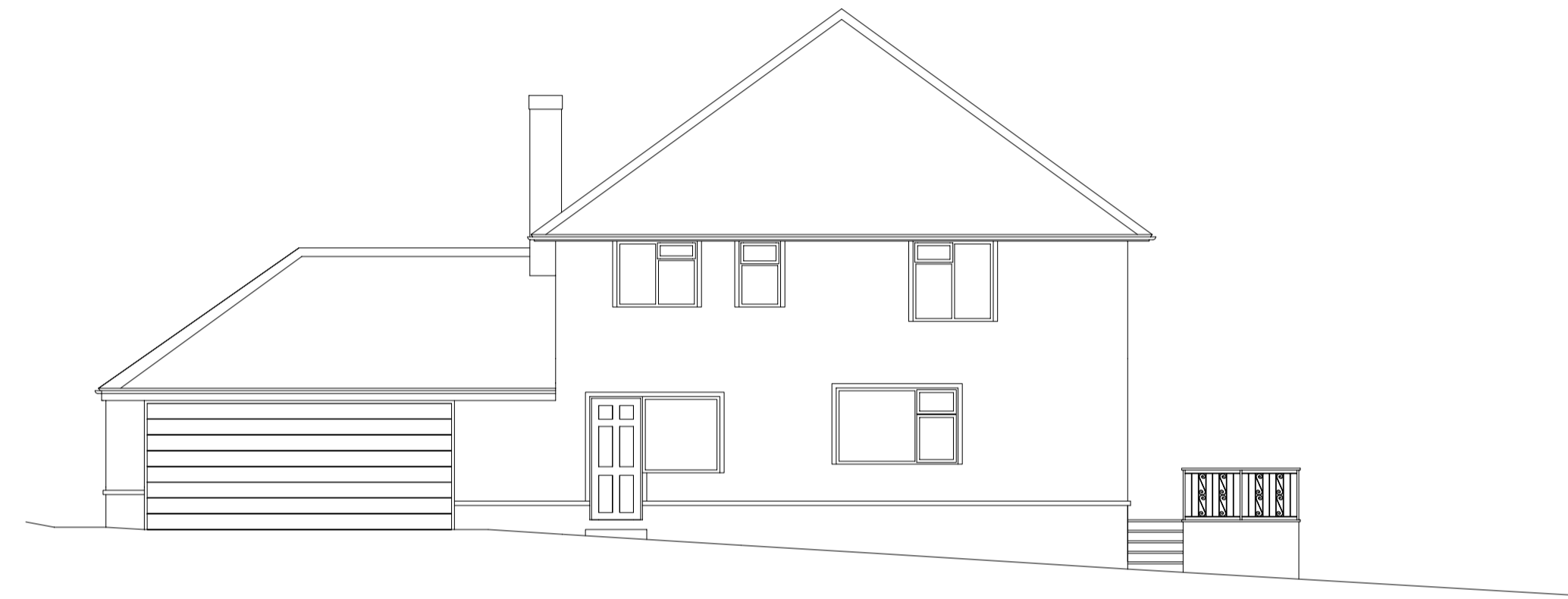
Existing Side Elevation 2