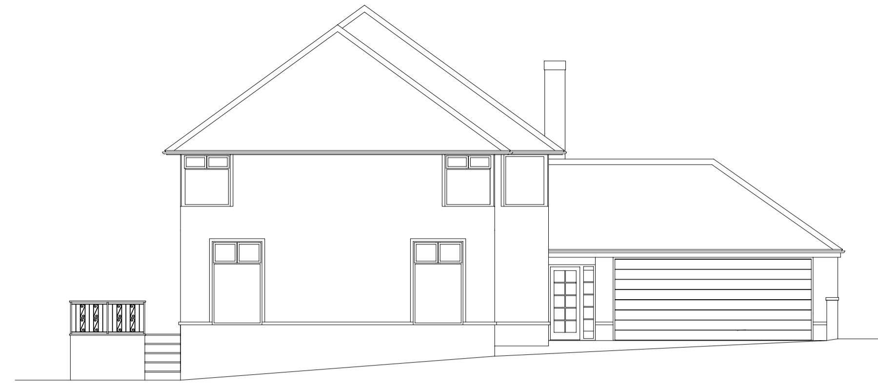
Existing Side Elevation 1