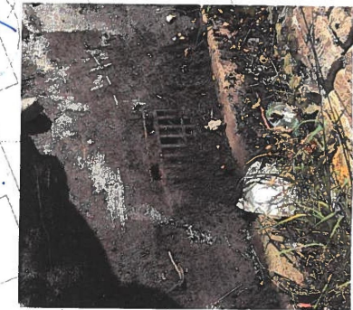
GULLY FOUND 06/06/2019. SPEN VIEW