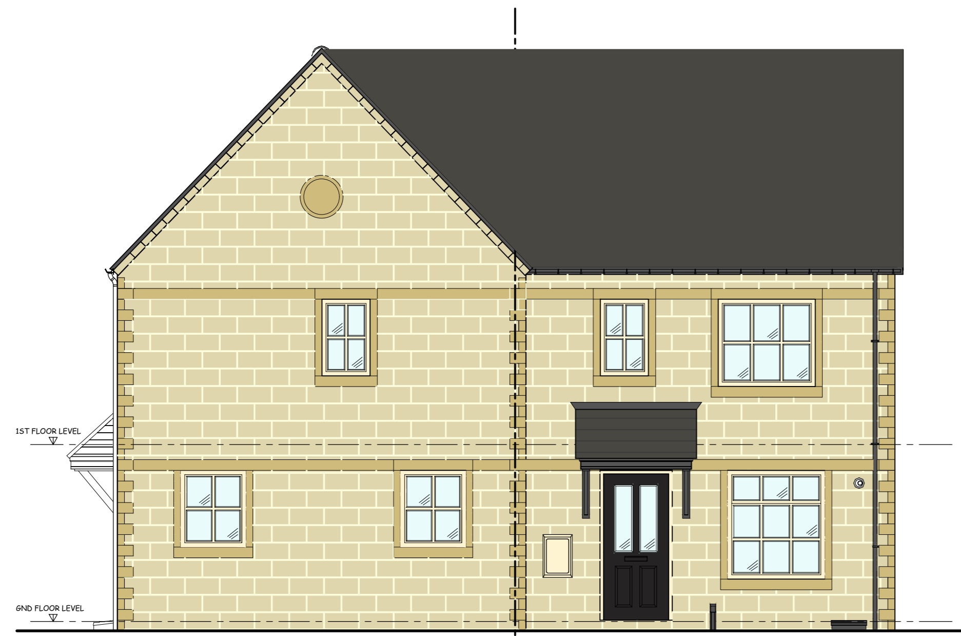
PROPOSED FRONT ELEVATION (1/50 SCALE)