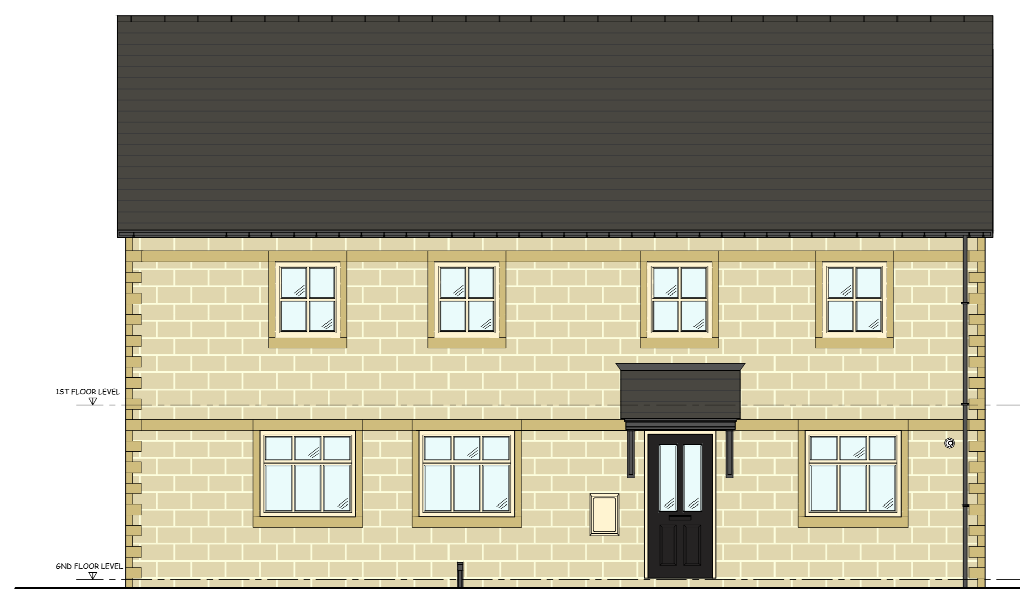
PROPOSED SIDE ELEVATION (1/50 SCALE)