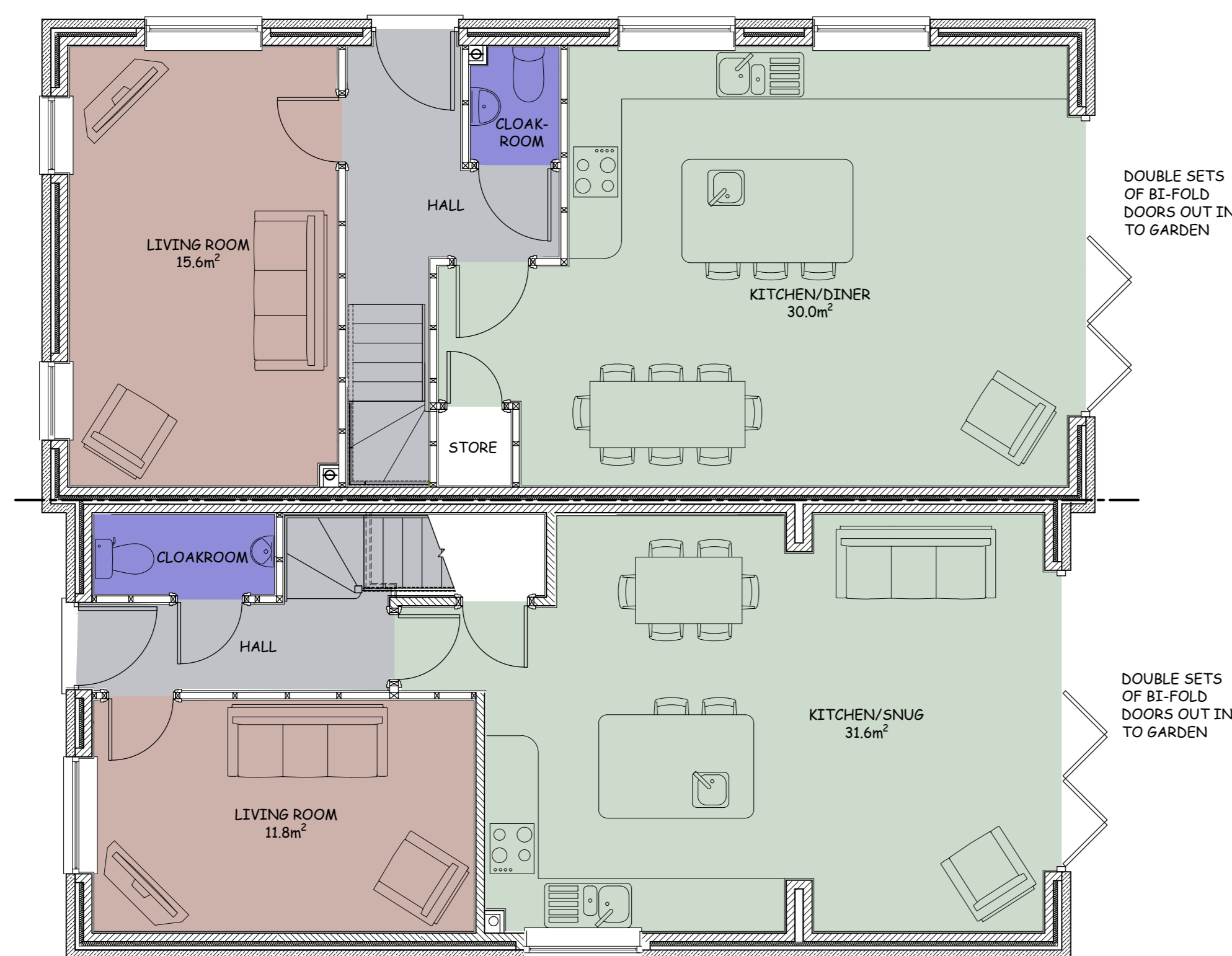
PROPOSED GROUND FLOOR PLAN (1/50 SCALE)