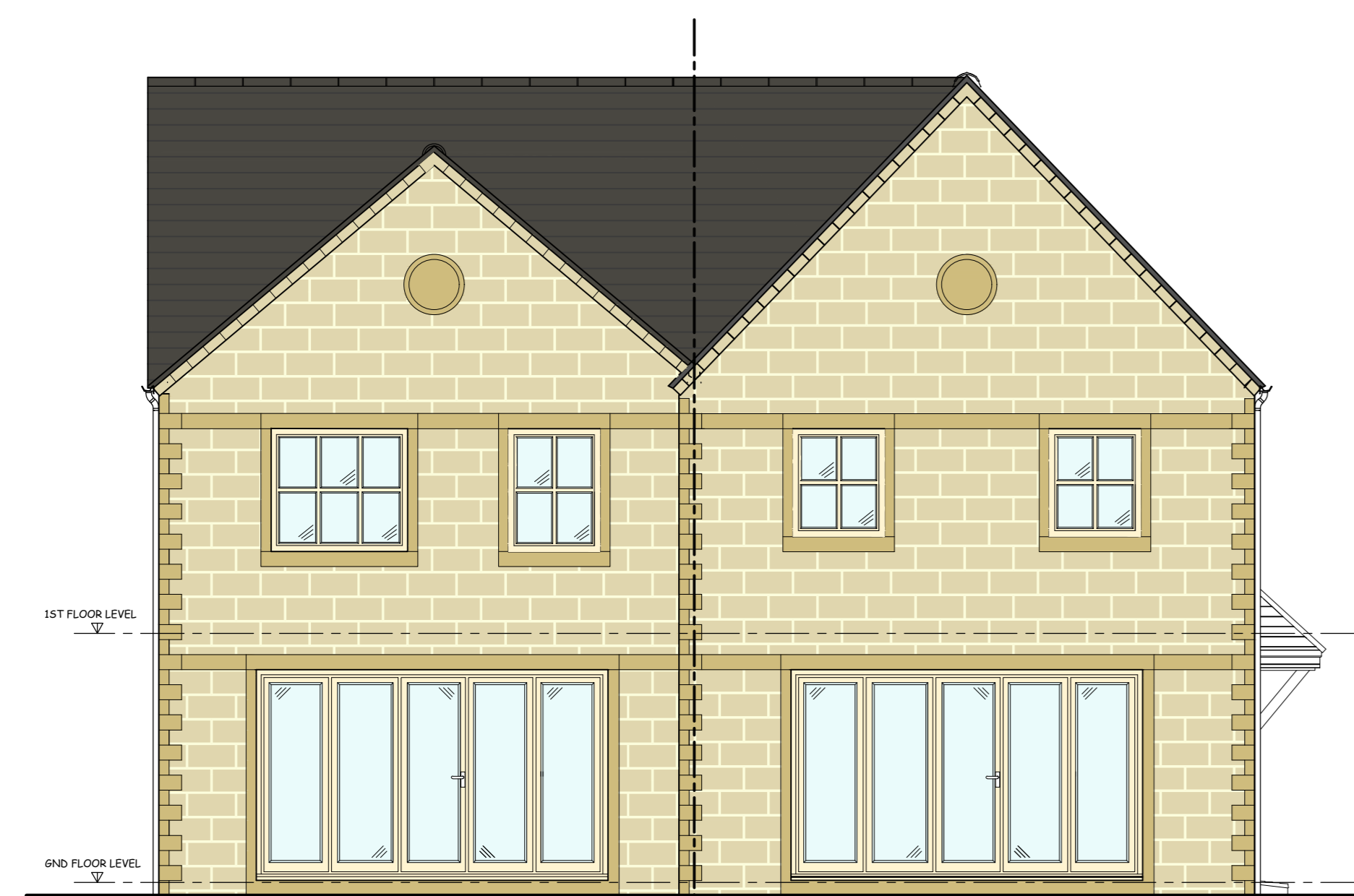
PROPOSED REAR ELEVATION (1/50 SCALE)