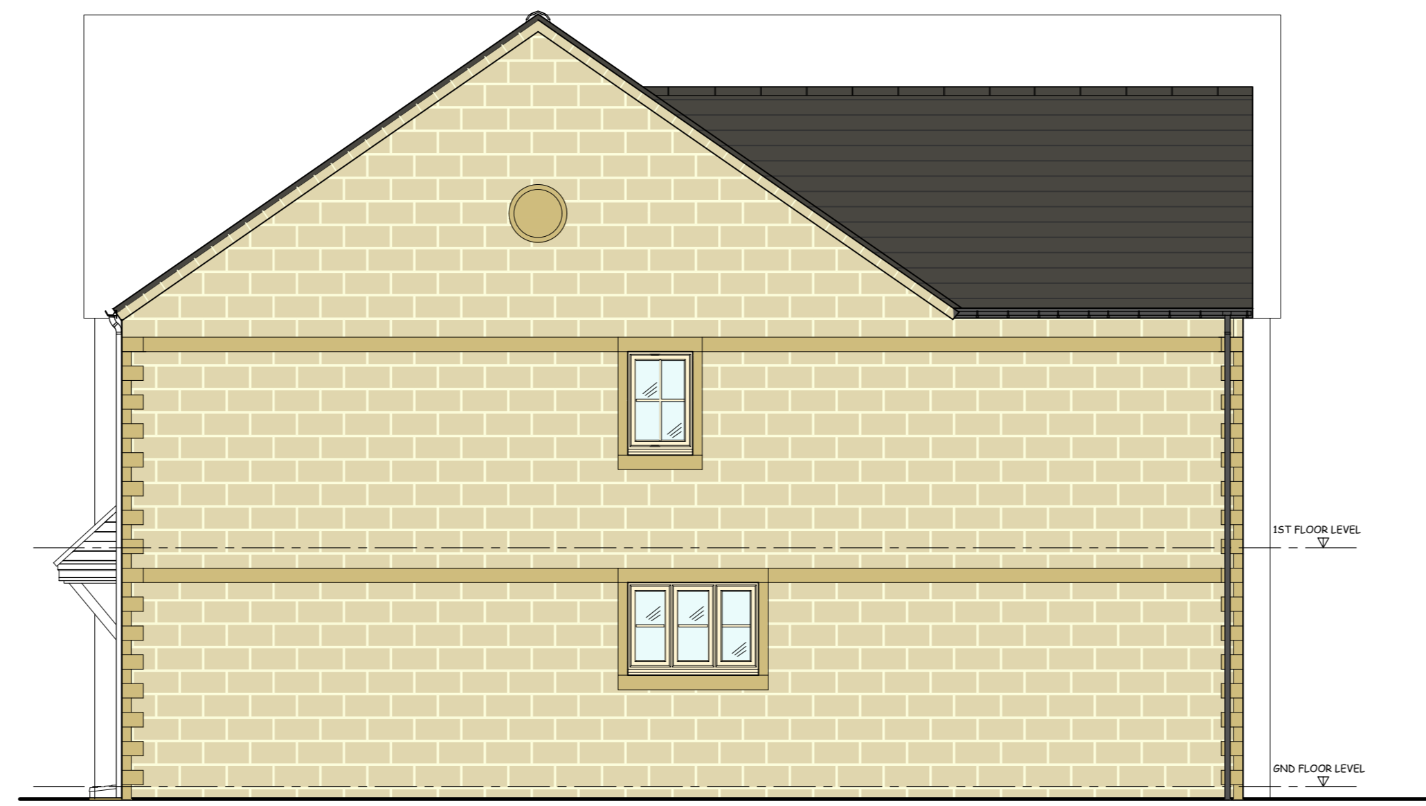
PROPOSED SIDE ELEVATION (1/50 SCALE)