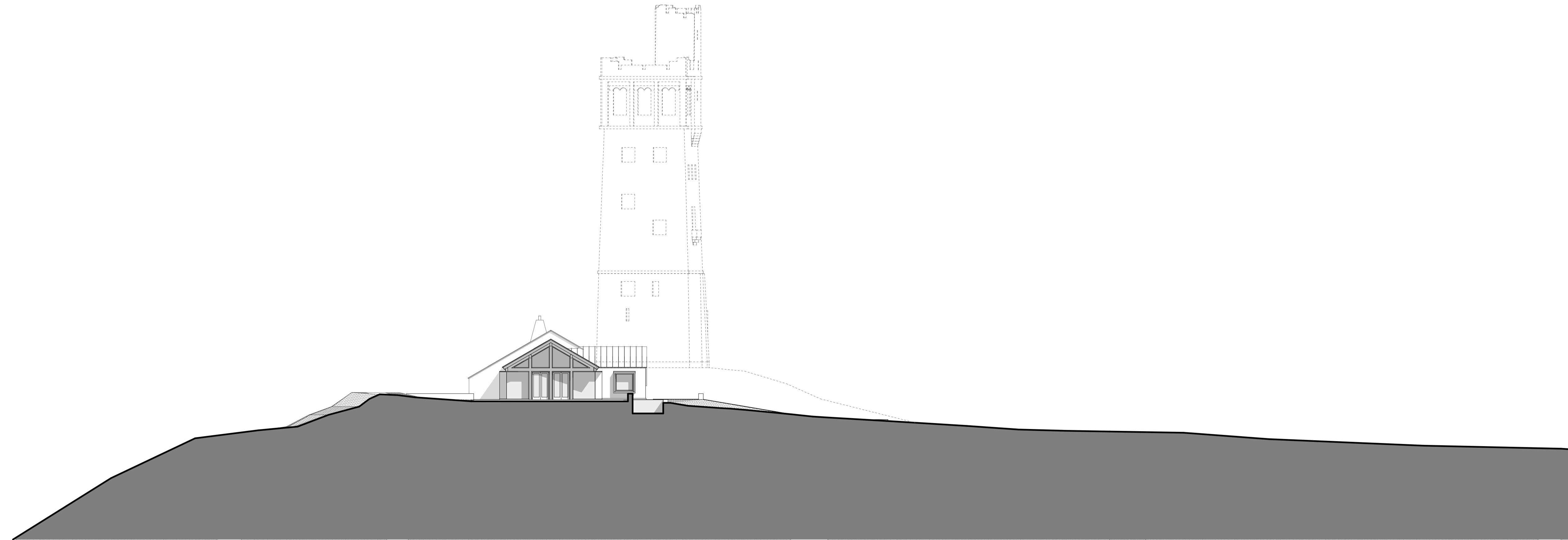
Proposed North Elevation 1:200