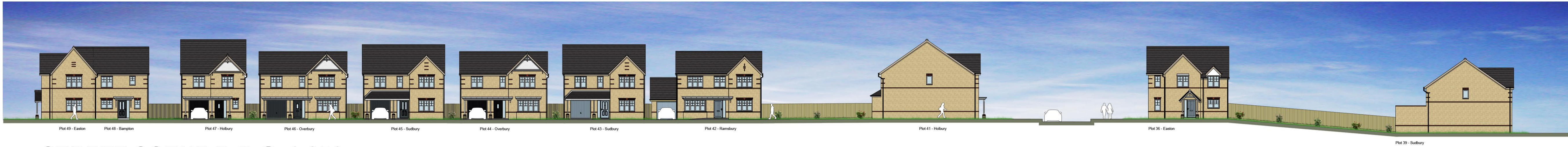
STREET SCENE B-B @ 1:250