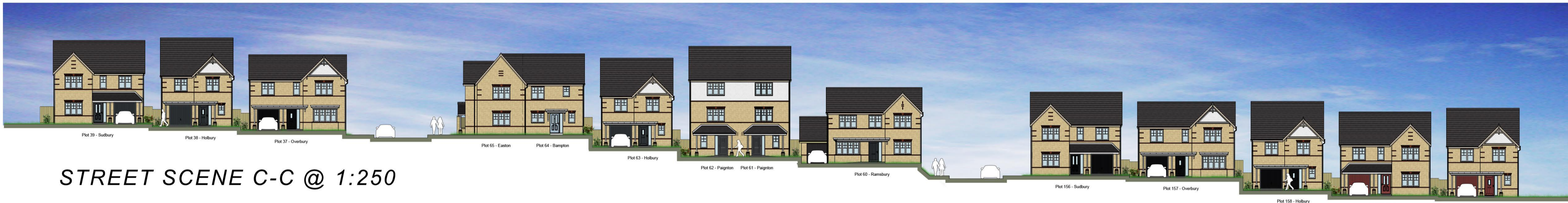
STREET SCENE C-C @ 1:250