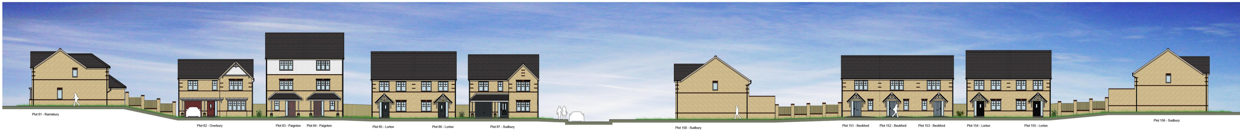
STREET SCENE D-D @ 1:250