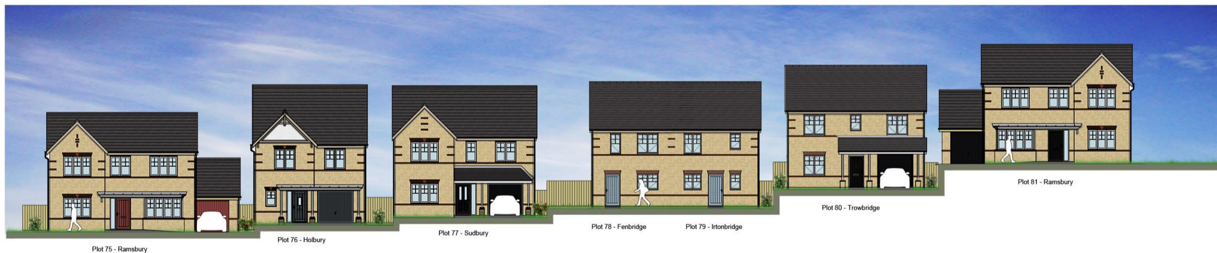
STREET SCENE E-E @ 1:250