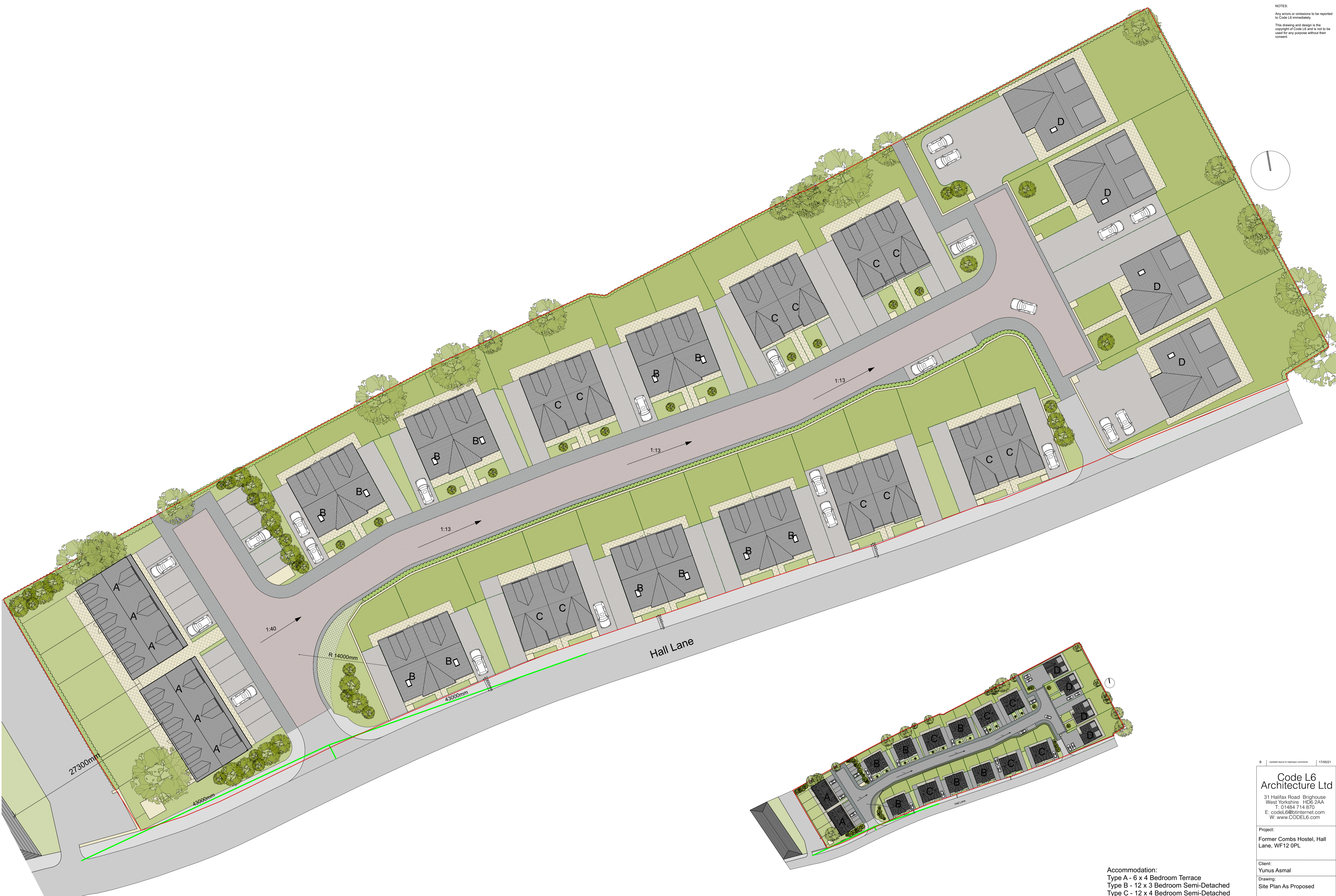
Site Plan As Proposed Scale 1:250