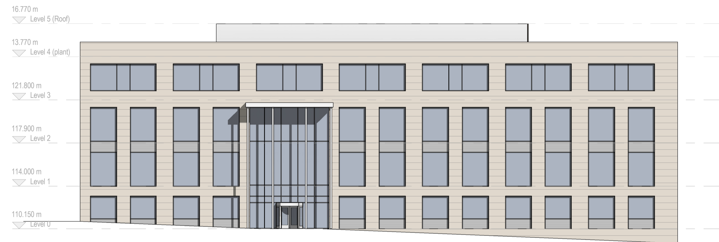
South Elevation_200 1 : 200