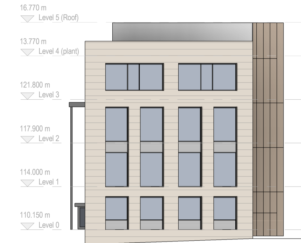
East Elevation_200 1 : 200