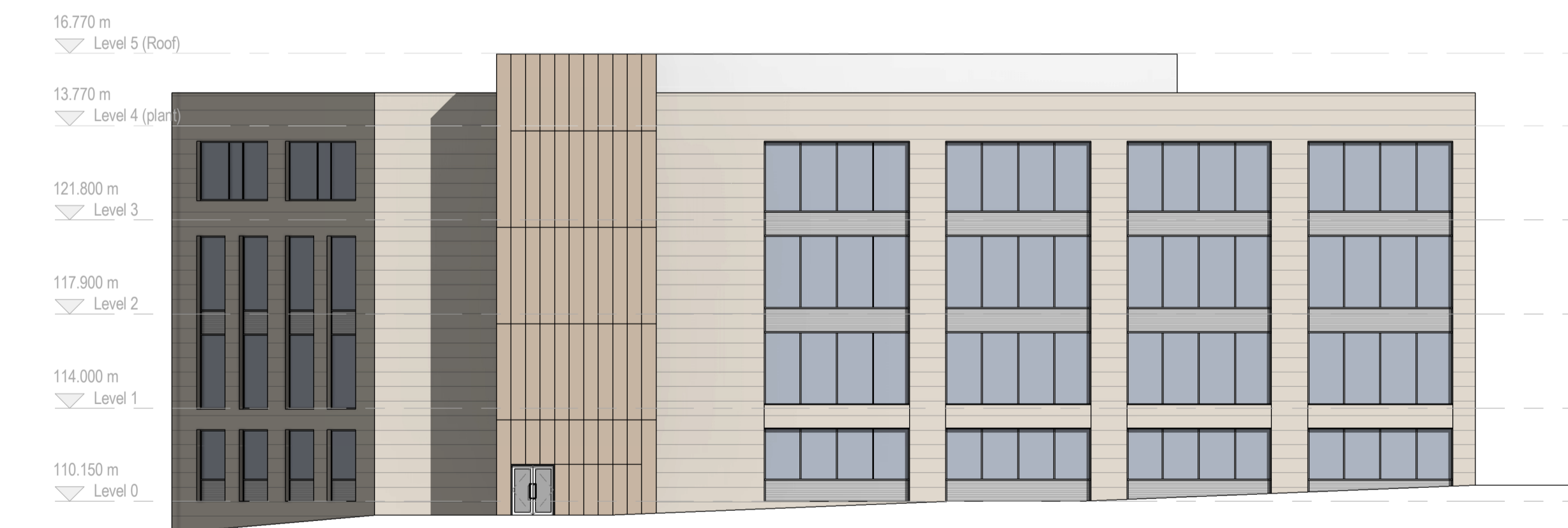
North Elevation_200 1 : 200

This drawing shows an indicative design only. Detailed planning permission is not sought for this building