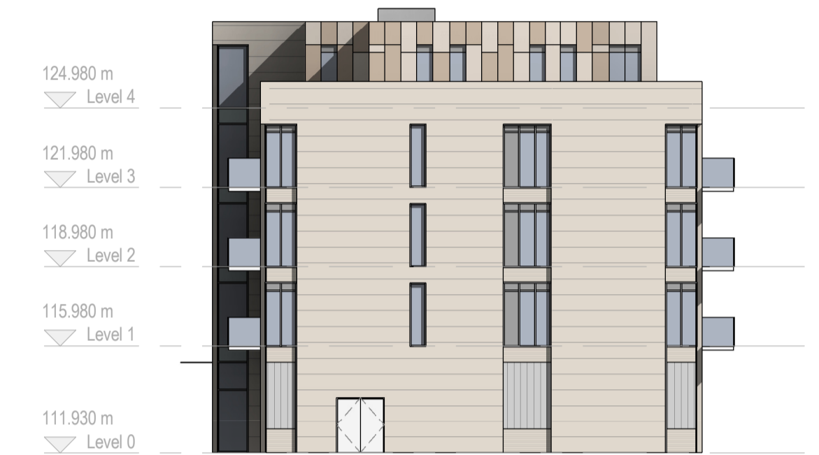
North Elevation_200 1 : 200