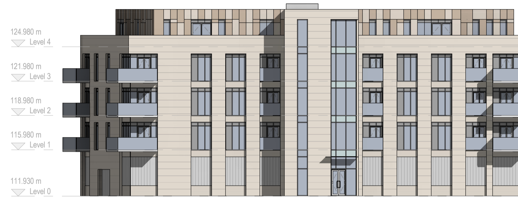
East Elevation_200 1 : 200