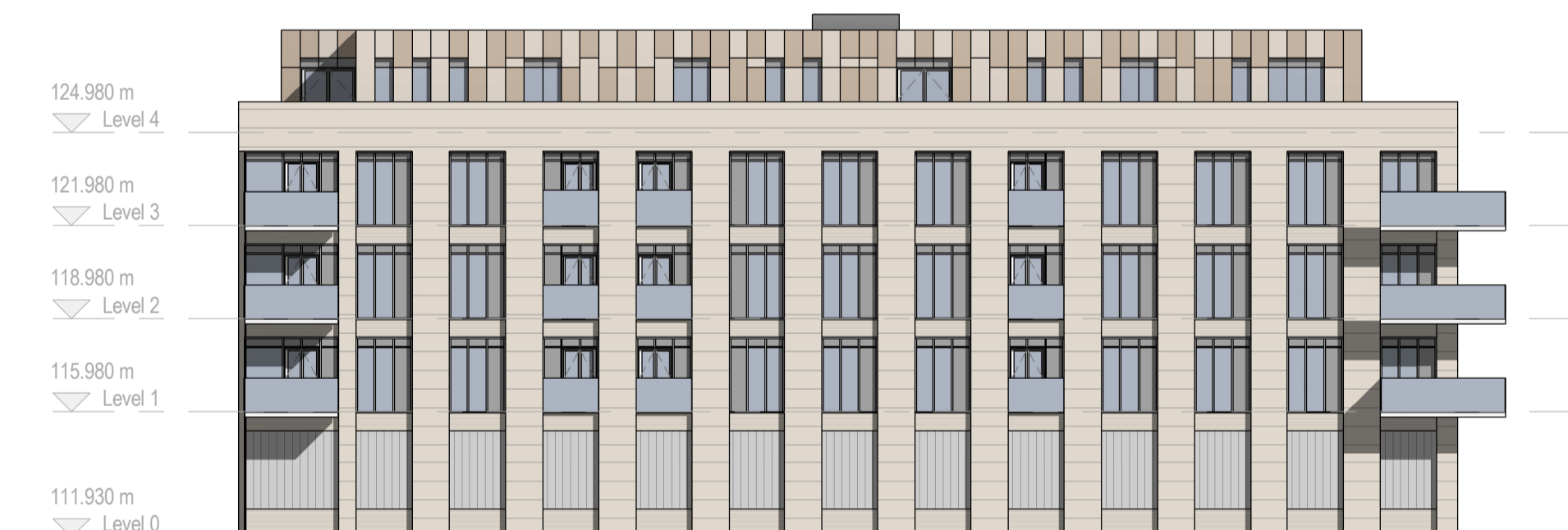
West Elevation_200 1 : 200

This drawing shows an indicative design only. Detailed planning permission is not sought for this building