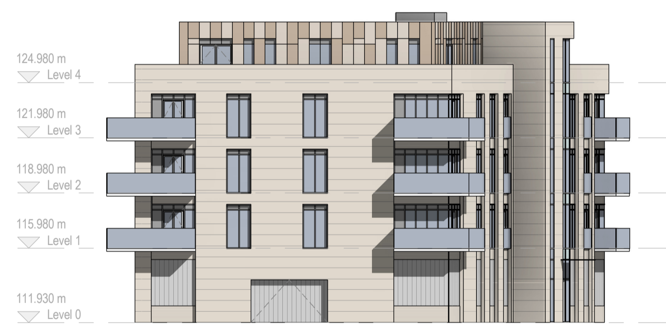
South Elevation_200 1 : 200